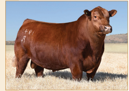
DUFF RED WOOD 19541 • Sire of Lot 46B