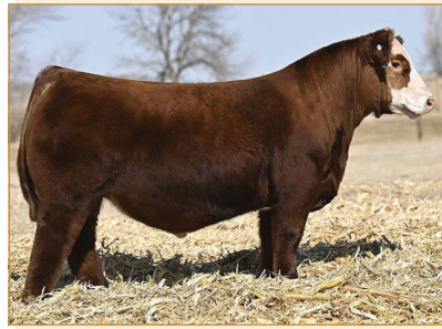
W/C BET ON RED 481H • Sire of Lot 46A