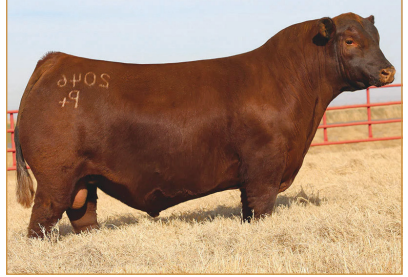
DUFF HD 2046 • Sire of Lot 46C