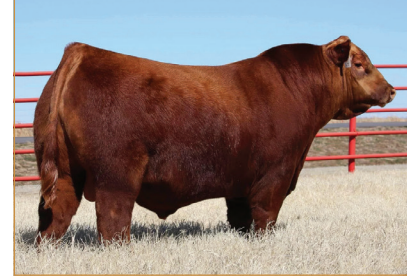
DUFF RED WINE 19540 • Sire of Lot 46D