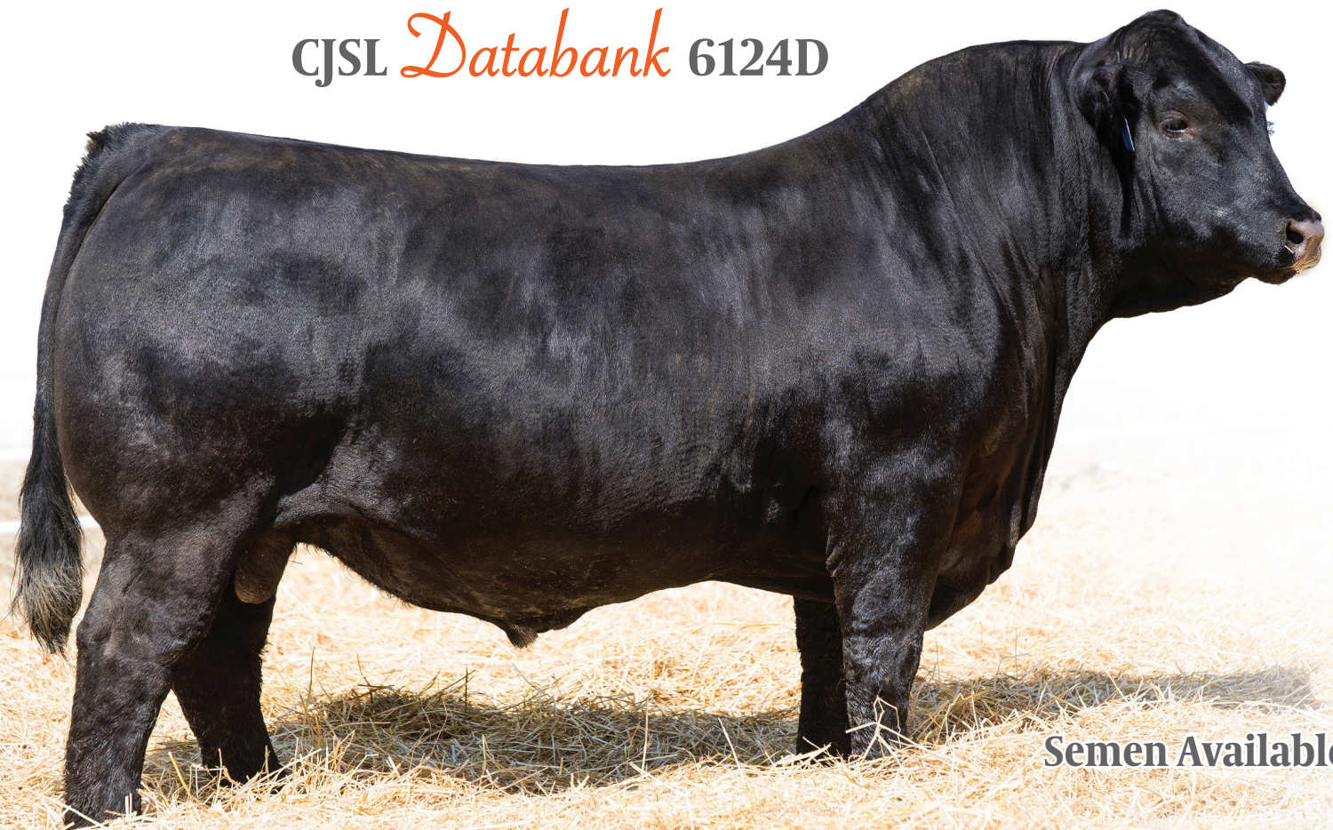
CJSL Databank 6124D

Semen Available Through Grassroots Genetics - 515-229-5227