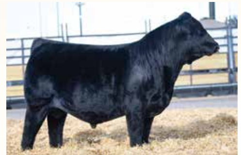
ELCX HIGH TIME 065H ET