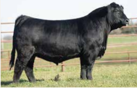
CELL-TNGC HITS THE MARK 2055H