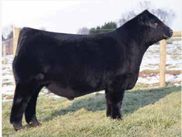
TASF HEINEKEN 405H • Sire of Lots 21, 22, 24 & 26

CELL Mile Marker ET 4361M ET is a homo polled, homo black Lim-Flex embryo transfer bull sired by TASF Heineken 405H ET and out of the proven MAGS Beth ET donor. He recorded a strong 758 lb. adjusted weaning weight and over 1,250 lb. adjusted yearling, showing consistent growth and performance. Mile Marker offers balanced calving ease with solid weaning and yearling numbers, along with useful carcass merit and maternal backing from a respected cow family. A dependable, well-rounded bull designed to add performance and pedigree strength to a variety of breeding programs.