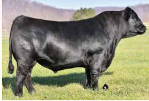
COLE GENESIS 86G