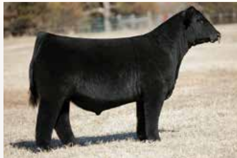
STAG GOOD TIMES 201 ET