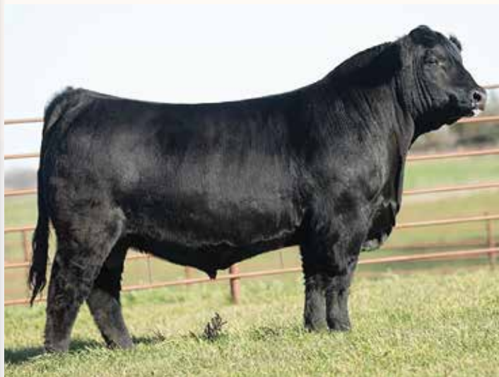
CELL-TNGC HITS THE MARK 2055H · Sire of Lot 20, 23 & 25

CELL Momentum 4358M is a homo polled Lim-Flex bull sired by TASF Heineken 405H ET and backed by a Dodge Ball daughter tracing to strong maternal genetics. He recorded nearly 600 pounds of adjusted weaning weight and 1,200 pounds at yearling, offering steady, practical growth from start to finish. Momentum provides a balanced calving ease profile with moderate birth weight and useful maternal backing, making him a functional option for commercial programs. A sound, workmanlike bull designed to sire consistent, easy-managing calves that perform in real-world conditions.