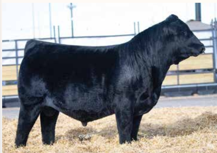
ELCX HIGH TIME O65H ET · Sire of Lot 42

Northern Range is a stout, well-balanced bull that blends proven maternal strength with a practical, work-ready design. He is sired by L7 Koko 2064K, a sire recognized for producing cattle that are structurally sound, efficient, and adaptable across a wide range of breeding programs. Koko progeny are valued for their balance and functional build. The dam, CELL 3091L, traces to the Faultless and Westwind cow families, lines known for fertility, longevity, and dependable production. This influence is evident in Northern Range's depth of body, sound structure, and overall usability. With strong profitability rankings and a balanced trait profile, he offers a reliable option.