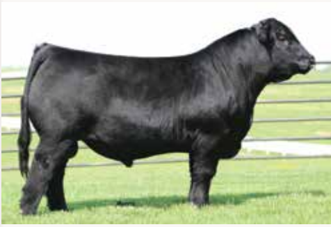
AUTO LUCKY GUY 140D ET