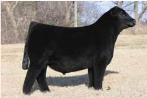
CONLEY NO LIMIT