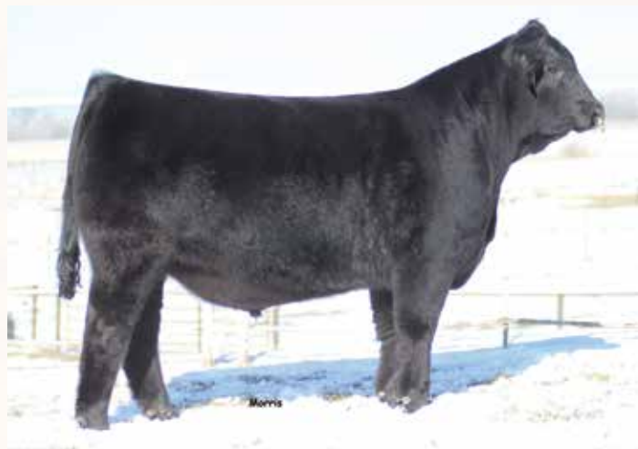
MAGS AVIATOR · Maternal grandsire to Lot 10

CELL Mainline 4306M is a sound, functional, lim-flexy, built around proven genetics and real-world usability. He is sired by CELL-TNGC Hits The Mark 2055H, a sire recognized for producing cattle with muscle, balance, and durability while maintaining structural correctness and efficiency. The dam, CELL 9529G, stems from the MAGS Aviator and PVF Insight cow families, lines known for fertility, longevity, and dependable production. This pedigree shows through in 4306M's body shape, structural integrity, and practical build. Mainline offers a steady, reliable option for programs seeking consistency, functionality, and long-term value.