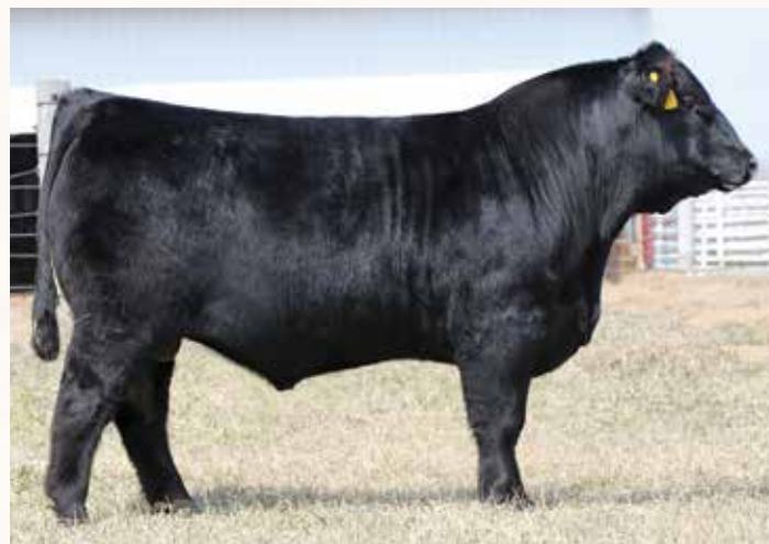
CELL ENVISION 7023E • Sire of Lot 2

Owned with Vorthmann Limousin, Treynor, IA