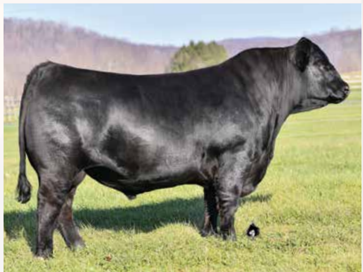
COLE GENESIS 86G • Sire of Lot 27

CELL Midnight Watch 4372M is a homo polled, homo black Lim-Flex bull sired by COLE Genesis 86G and backed by an Insight daughter with proven maternal influence. He posted a solid 667 lb. adjusted weaning weight and over 1,300 lb. adjusted yearling, showing consistent growth and performance. Midnight Watch offers a balanced calving ease profile with steady weaning and yearling numbers, along with useful carcass merit highlighted by ribeye strength. A practical, well-made bull suited for programs looking to maintain maternal value while adding dependable performance to their calf crop.