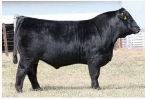
CELL ENVISION 7023E