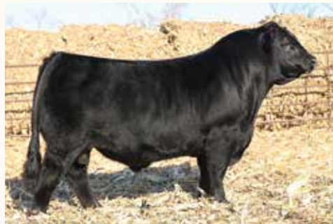
L7 KOKO 2064K