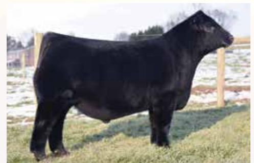
TASF HEINEKEN 405H ET