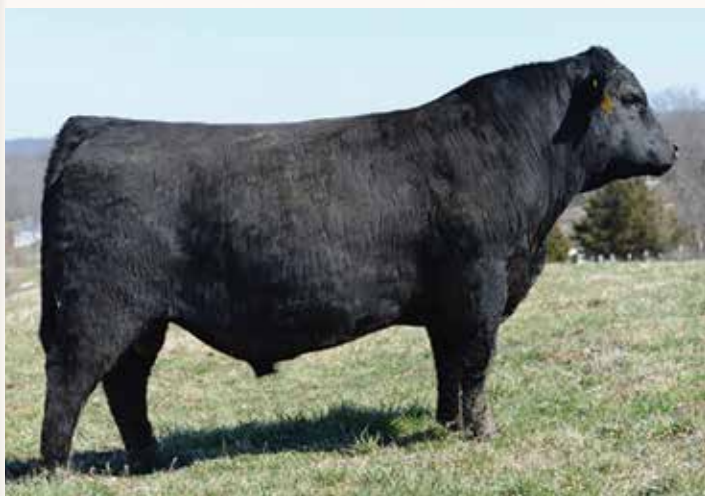
COLE HOMERUN 51H ET • Sire of Lots 49 & 50

CELL New Wave 5049N is a homo polled, homo black Lim-Flex bull sired by TASF Heineken 405H ET and backed by a productive Aviator-influenced female. He offers a balanced birth-to-yearling spread with a moderate birth weight and over 1,120 pounds of adjusted yearling performance, making him a practical option for programs focused on steady growth and consistency. His negative birth weight EPD and solid calving ease figures add flexibility, while strong carcass indicators—highlighted by marbling and ribeye—bring added value to his genetic package. A functional, well-made bull that fits operations looking for predictable, easy-managing cattle with added carcass merit.