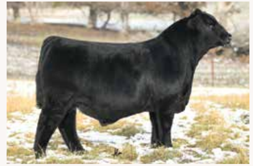
CELL LASTING IMPRESSION 3019L ET