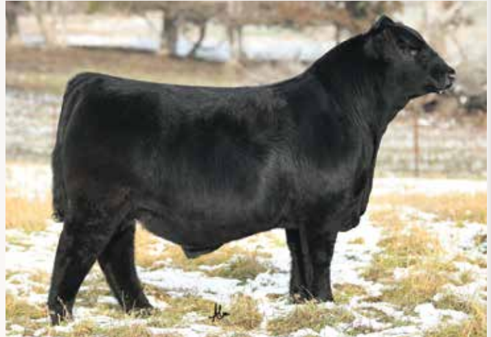
CELL LASTING IMPRESSION 3019L ET · Sire of Lots 52 & 54

CELL North Ridge 5092N is a homo polled, homo black Lim-Flex bull that combines pedigree strength with solid performance. Sired by CELL Lasting Impression 3019L ET and backed by a productive Data Bank daughter, he posted a strong 715 lb. adjusted weaning weight and over 1,180 lb. adjusted yearling, performing well within his contemporary group. North Ridge offers added calving ease with a favorable CED figure while still maintaining solid growth and carcass balance, highlighted by strong ribeye genetics. A practical, well-structured bull suited for programs looking to blend phenotype, maternal backing, and performance into one consistent package.