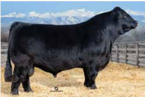
ELCX KINGS LANDING 599 D ET