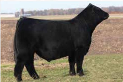
SSTS GUNS N ROSES 9408G ET