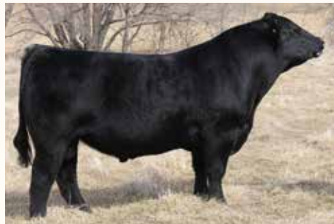
DEBV GLADIATOR 917G