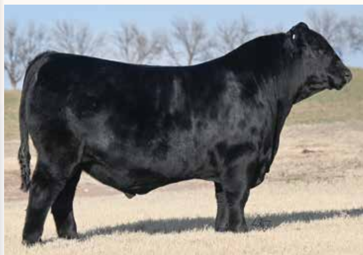
LFL KASH CARD 2156K ET · Sire of Lot 59

CELL New Outlook 5140N is a homo polled, homo black Lim-Flex bull sired by TASF Heineken 405H ET and backed by a Camden Yards daughter with strong maternal roots. He posted an impressive 767 lb. adjusted weaning weight and a solid 1,200 lb. adjusted yearling, ranking near the top of his contemporary group at weaning. New Outlook offers a balanced genetic profile with practical calving ease, steady growth, and useful carcass merit. A sound, functional bull suited for operations wanting to add pounds and maintain a consistent, easy-keeping cow base.