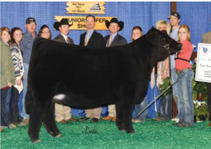
RIVERSTONE CHARMED • Dam of Lot 1