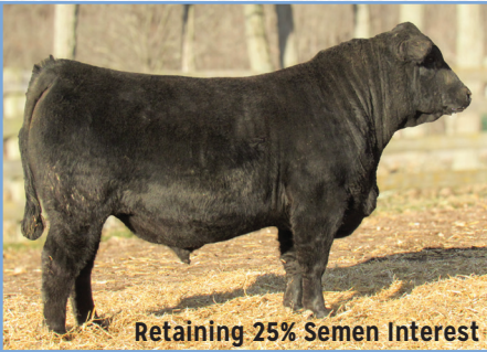
Retaining 25% Semen Interest