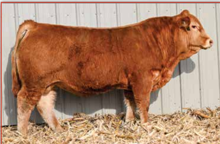
TREF LONE RANGER 577L • SIRE OF LOTS 9, 11 & 13

SYES New Beaner 651N is a rugged, power-built purebred that brings added muscle, shape and performance to the table. This homozygous polled, red son of SYES Knockout 23K is wide based, big topped and dense through his rib and quarter, offering the extra substance cattlemen appreciate in a herd sire. He couples that stout phenotype with solid growth credentials, ranking in the top 20% for yearling weight and top 25% for weaning weight, while maintaining a workable calving-ease profile.