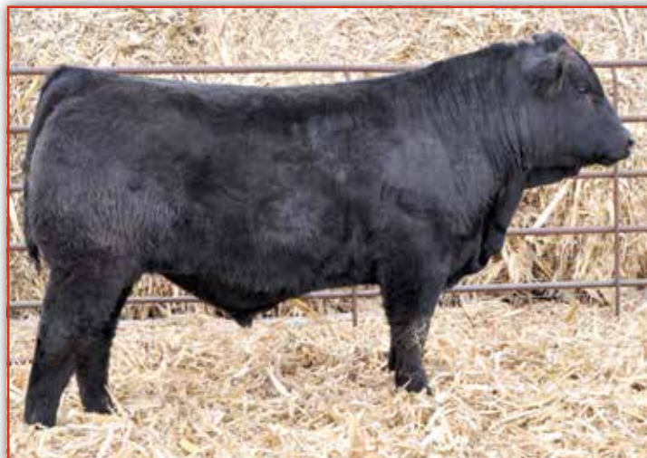
L7 GENUINE VISION 9033G • SIRE OF LOT 28

SYES Nato 266N is a stout, high-performing purebred that brings added muscle and growth in a balanced, eye-appealing package. This scurred son of L7 Genuine Vision 9033G is long bodied, square hipped and sound on the move, offering both substance and structural integrity. With strong growth and added carcass merit, Nato is built to add pounds and value while maintaining a practical, functional design.