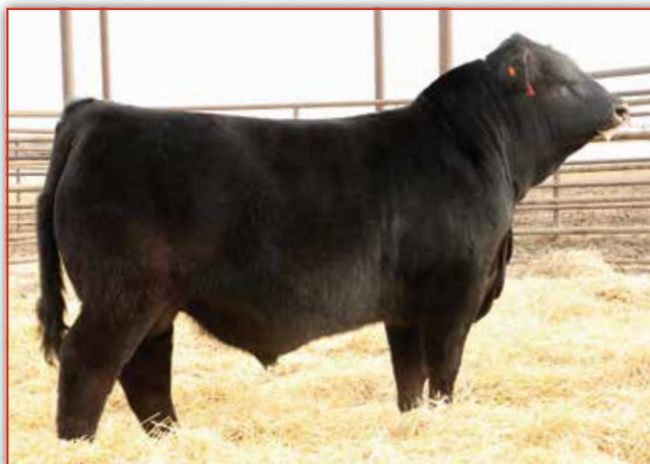
WULFS LONG HAUL K503L ET • SIRE OF LOT 50

SYES Noel 58N is a stout, rugged purebred bull built with extra body, depth and muscle shape. Sired by Wulfs Long Haul K503L and backed by a Checking Account-influenced cow family, he offers added growth and carcass merit with the kind of durability and structure designed for real-world production.