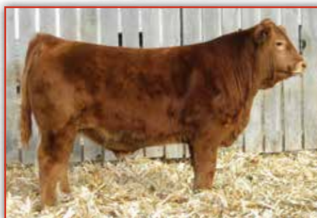
SYES HARDROCK 65H