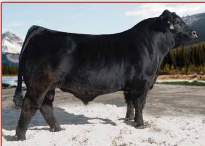
RUNL JUSTIFIED 364 J • SIRE OF LOT 6

SYES New Wave 156N is a heifer-safe purebred that offers an attractive blend of calving ease, balance and extra shape. This homozygous polled, red son of TREF Lone Ranger 577L is smooth shouldered, long bodied and sound on the move, with a square hip and enough muscle to remain production relevant. He brings added confidence to the calving pasture with a top 20% ranking for calving ease and a manageable birth weight profile, while still posting solid growth that ranks him in the top 40% for yearling weight.