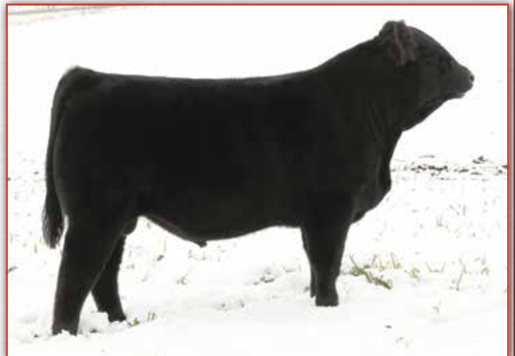
RMKR HERCULES 020H • SIRE OF LOT 96

Miss SYES Walk 3M is a powerful, big-ribbed purebred female backed by generations of proven Walk the Walk and Wulfs cow families known for structural integrity and longevity. She combines real-world performance with excellent carcass merit and a strong maternal base, offering the kind of productivity, depth and durability that make elite brood cows in progressive Limousin programs.