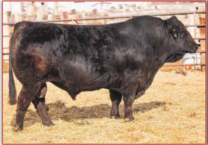
SYES EASY GOING 77E • SIRE OF LOTS 18 & 19

SYES Networker 22N is a deep-ribbed, big-bodied purebred that combines cow power, growth and eye appeal in a practical, production-ready package. This homozygous polled, red son of SYES Easy Going 77E is bold through his middle, wide based and sound structured, giving him the kind of look that holds up from pasture to payweight. He separates himself with an elite growth profile—ranking in the top 5% for yearling weight and top 3% for weaning weight—while still maintaining a usable calving-ease spread.