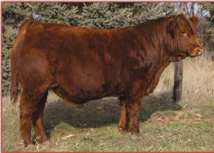
JBV GOLDSTONE 306L • SIRE OF LOT 105

Miss SYES Goldstone 157N is an elegant, feminine-made heifer that offers an attractive blend of eye appeal and structural correctness. She is smooth through her front end, clean at the shoulder and carries herself with a stylish, balanced look that reads quality from every angle. By JBV Goldstone and out of a proven Wulfs Xcellsior daughter, 157N brings together refinement, soundness and maternal strength—making her the kind of young female that fits seamlessly into progressive breeding programs focused on both look and longevity.