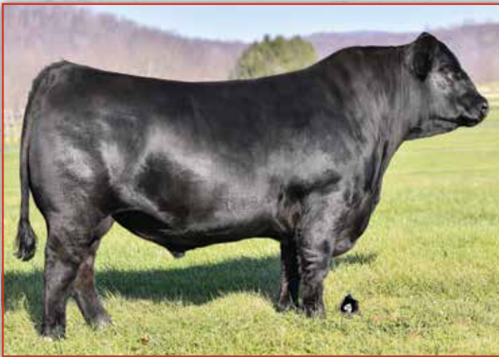
COLE GENESIS 86G • SIRE OF LOTS 91 & 92

Miss SYES Genesis 182M is a powerful young purebred female blending proven maternal strength with modern performance, sired by COLE Genesis 86G and backed by a dependable Xclusive × User Friendly cow family. She offers a well-balanced EPD profile highlighted by strong growth, solid milk and elite dollar indexes, positioning her as a high-upside donor prospect or a cornerstone female for programs focused on longevity, functionality and genetic consistency.