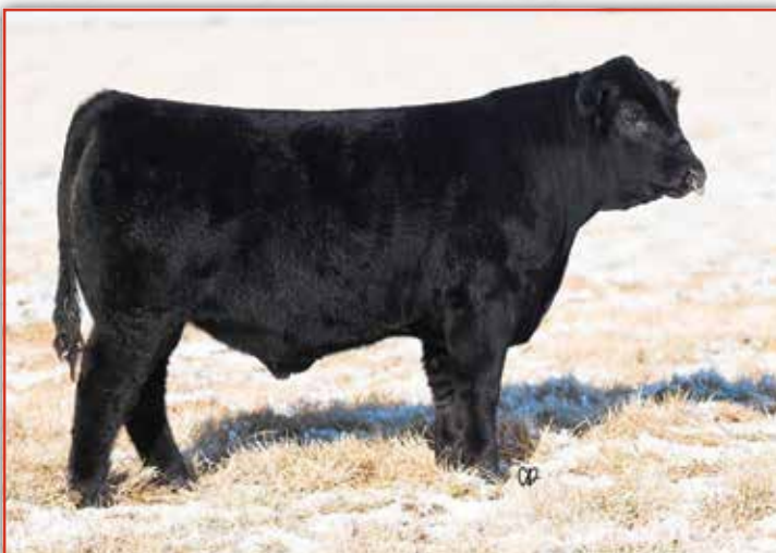
LEWIS GRAVITY FLOW G62 • SIRE OF LOT 48

SYES Niles 21N is a moderate, clean-made percentage bull that blends calving ease, balance and functional growth. Sired by Lewis Gravity Flow G62 and backed by a dependable maternal line, he offers a practical option for adding consistency, structure and usability to both commercial and seedstock programs.