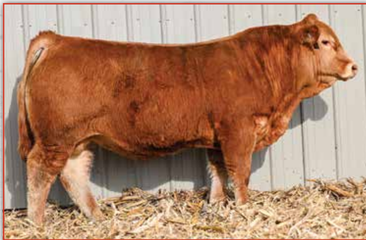
TREF LONE RANGER 577L • SIRE OF LOTS 70 & 72