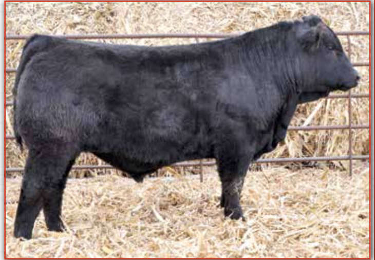
L7 GENUINE VISION 9033G • SIRE OF LOT 88

Miss SYES Gen Vis 302M is a powerful, purebred red cow that blends elite performance with a pedigree stacked with proven maternal and carcass influence. Sired by L7 Genuine Vision 9033G and backed by a strong Barn Burner × Checking Account cow family, she excels for growth and carcass merit while maintaining sound structure and functional design, making her a high-value female for programs focused on performance-driven, productive replacements.