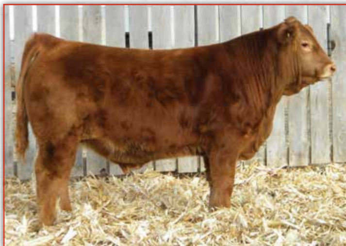
SYES HARDROCK 65H • SIRE OF LOT 34

SYES Neptune 5N is a stout, muscular purebred that offers extra shape and power in a sound, well-balanced design. This homozygous polled, red son of SYES Hardrock 65H is deep bodied, square made and built to hold condition while maintaining structural integrity. With steady growth and added carcass value, Neptune is a practical option for adding muscle and durability to a calf crop.