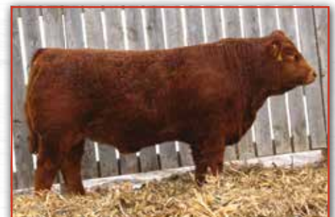
SYES JOHN DOE 123J