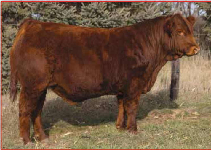
JBV GOLDSTONE 306L • SIRE OF LOT 32

SYES Northwest 110N is a heifer-safe purebred that combines elite calving ease with a clean, functional build. This homozygous polled, red son of SYES Knockout 23K is smooth shouldered, sound on his feet and moderate framed, making him an easy choice for use on young females. With a strong calving-ease profile and maternal balance, Northwest is built for problem-free starts and long-term productivity.