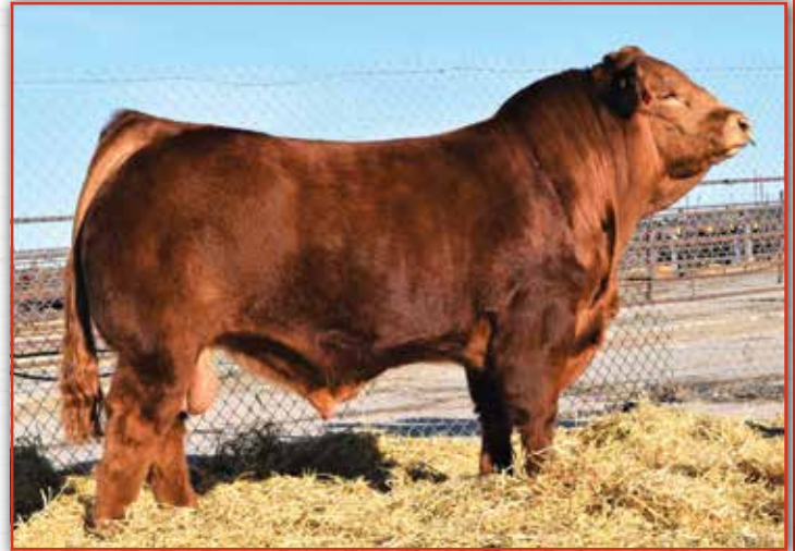
JYF EXTRA CHUNK 518E • SIRE OF LOTS 93, 94 & 95

Miss SYES Ex Chunk 323M is a powerful, big-ribbed purebred female combining the Extra Chunk sire line with the proven Devil's Lake cow family, offering a blend of muscle, capacity and maternal strength. She posts strong performance ratios and a balanced EPD profile with added ribeye and carcass merit, making her the kind of cow that can add value both in the pasture and through the sale ring while maintaining long-term productivity.