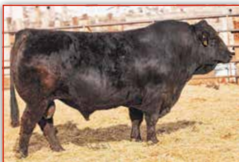
SYES EASY GOING 77E