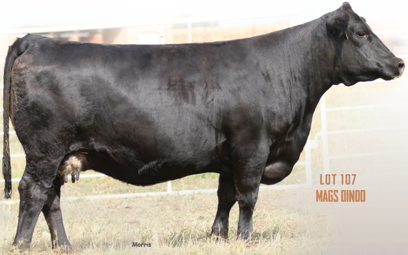
LOT 107 MAGS DINDO