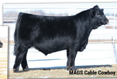
MAGS Cable Cowboy