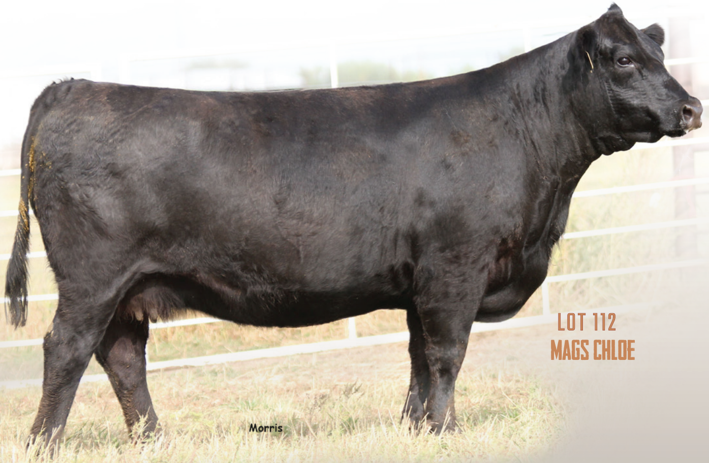
LOT 112 MAGS CHLOE