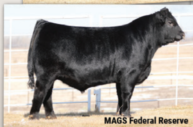
MAGS Federal Reserve