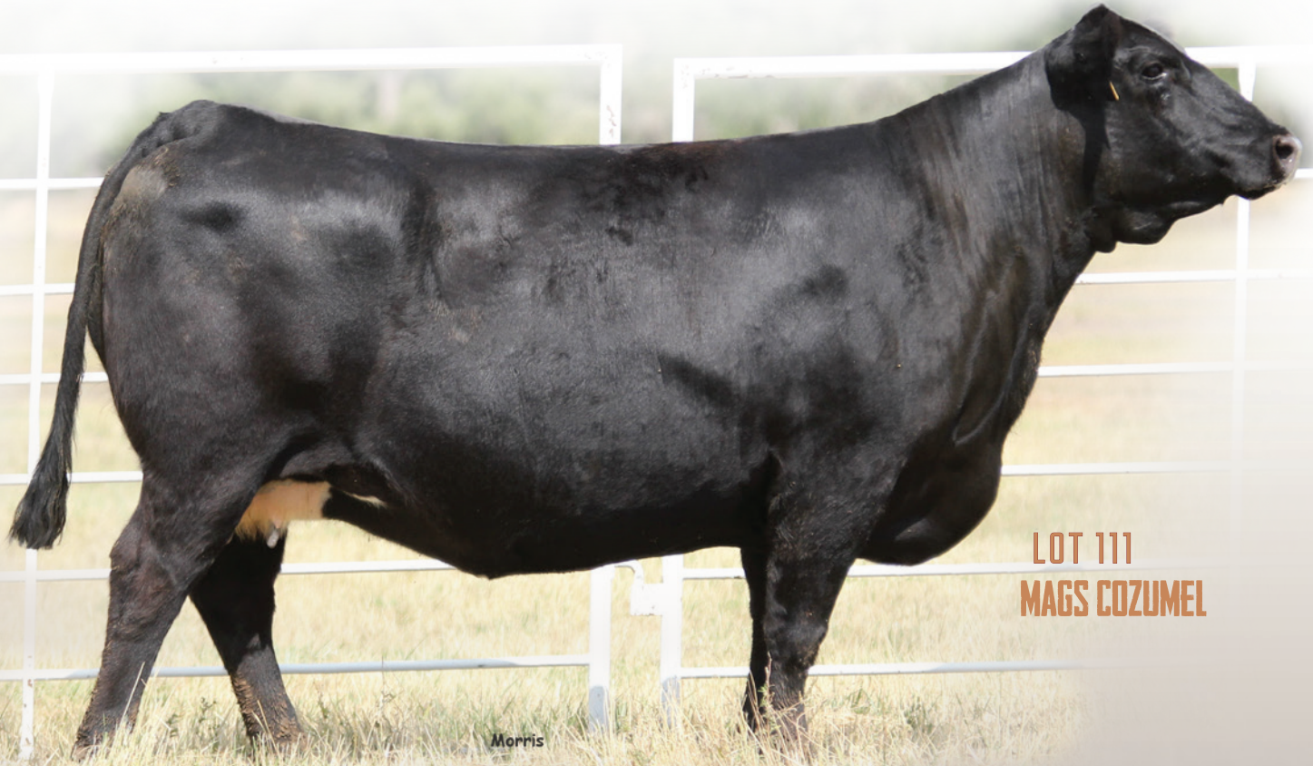
LOT 111 MAGS COZUMEL