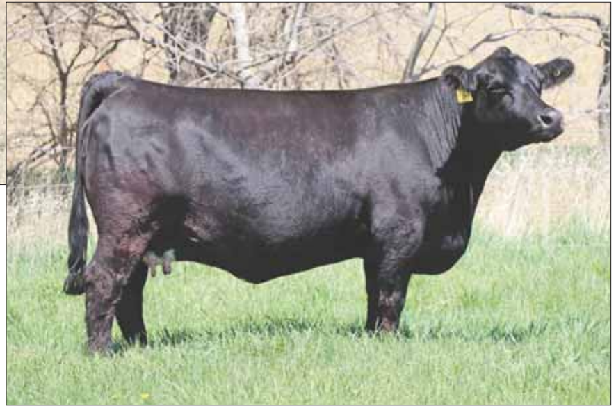
DAM: MAGS Zahoo