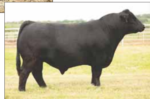
SIRE: SSTO Fortitude 8914F