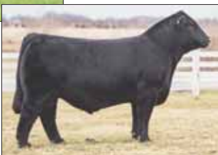
SIRE: FWLY Can Do