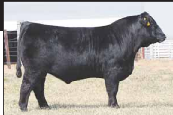
SIRE: CELL Envision 7023E

AHCC WESTWIND W544 LVLS 9066U TW FIRE N' ICE PBRS ULL 854U AHCC XPENSIE ACCOUNT X516 COLE MISS TRAVELER 029X DHVO DEUCE 132R MAGS RAMADA