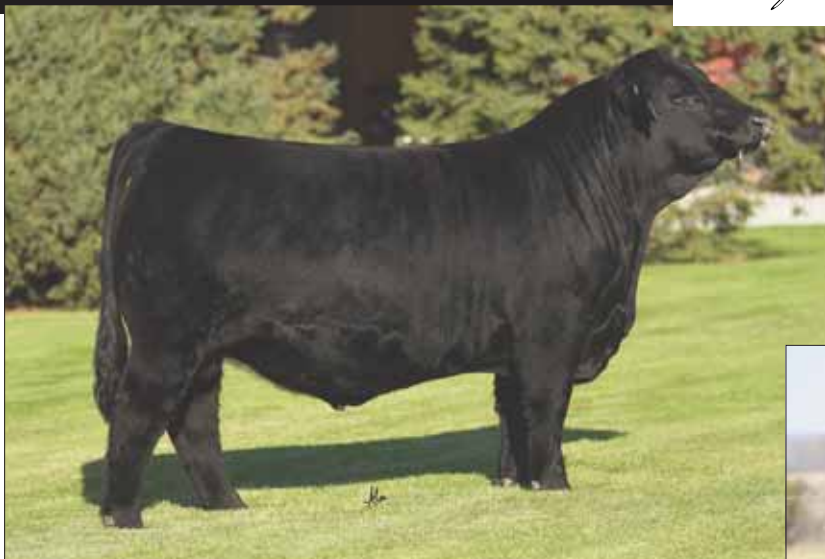
SIRE: WLR Final Call ET