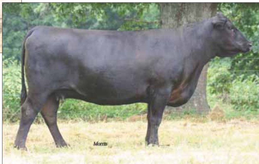
DAM: EXLR Barb 157R