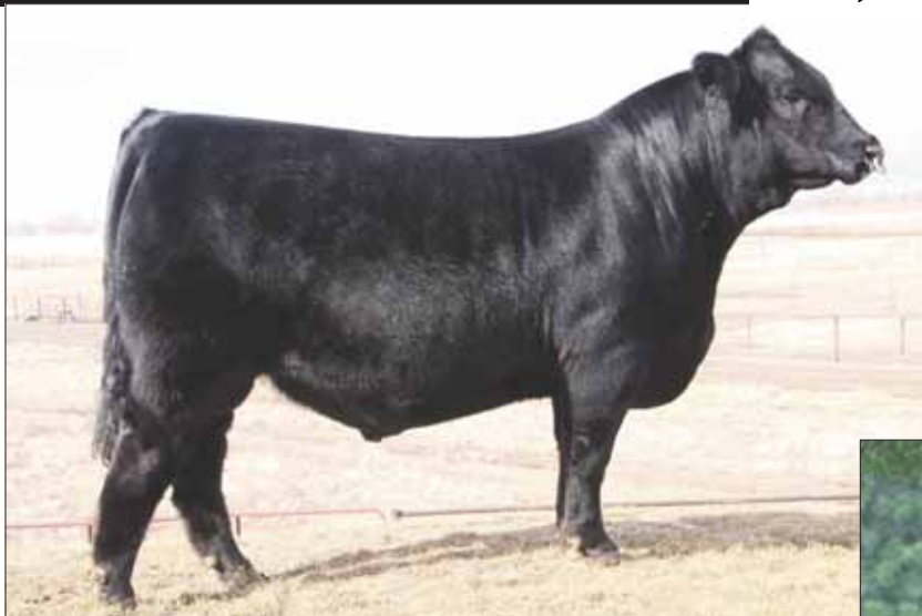
SIRE: MAGS Wazowski