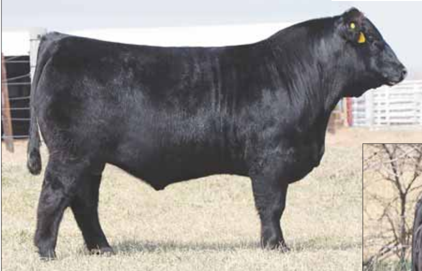
SIRE: CELL Envision 7023E