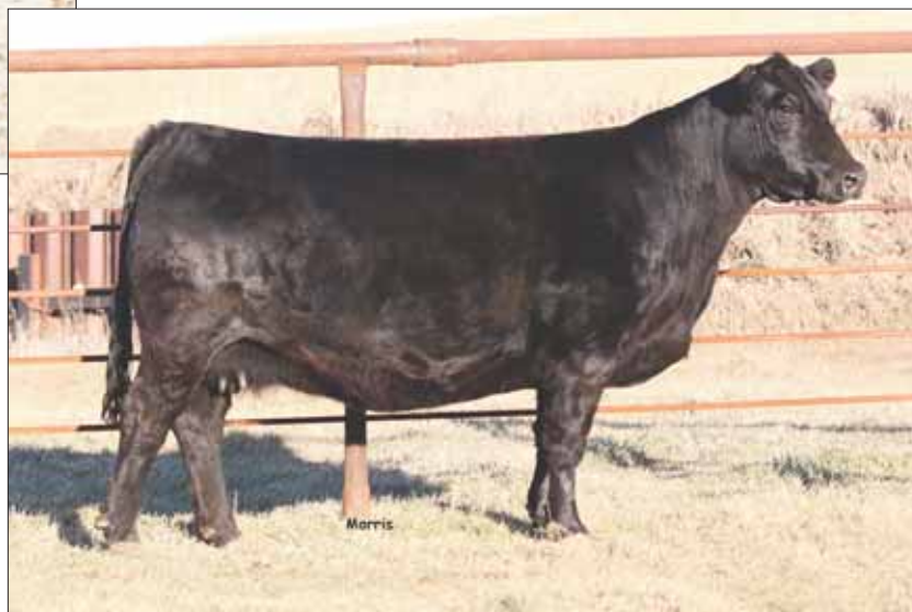
DAM: LVLS Without U 9098W