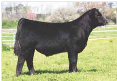
FULL SIB: ELCX High Time 065H