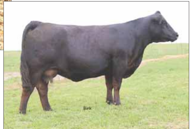
DAM: L7 Yuma 122Y