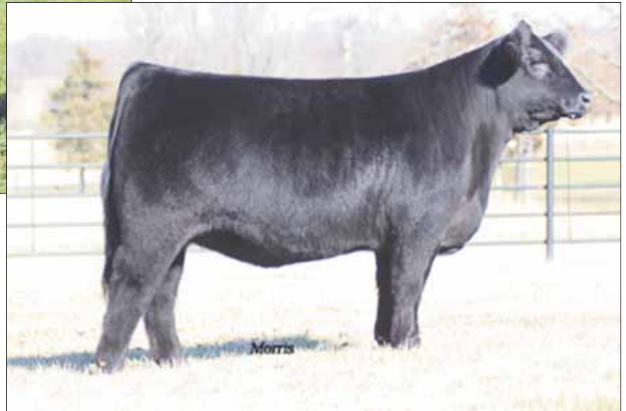
DAM: AUTO Poem 273Y