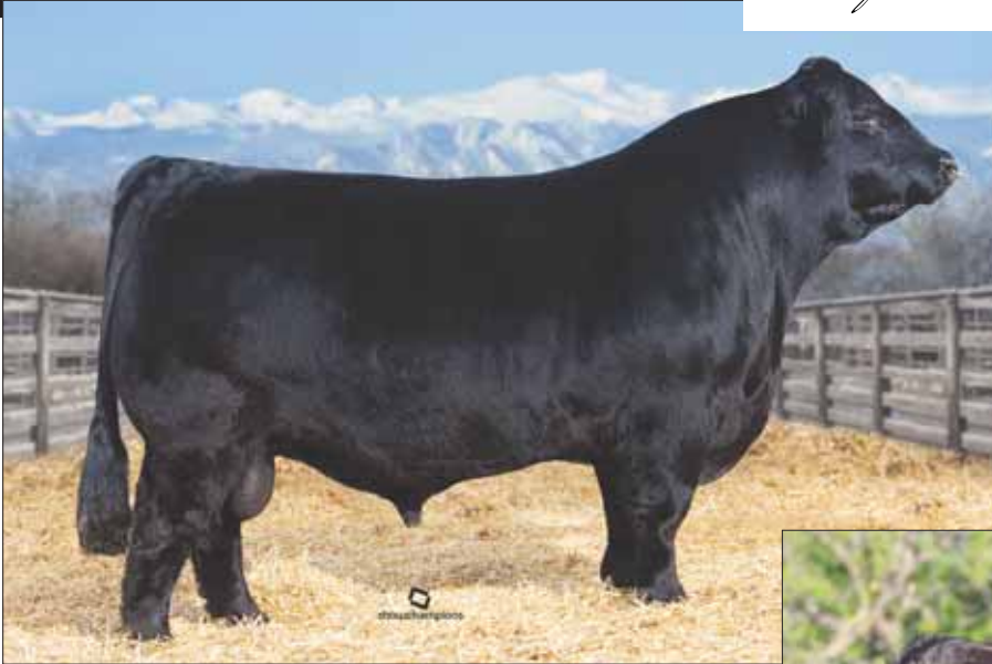
SIRE: ELCX Kings Landing 599D