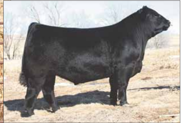
SIRE: Alter Ego