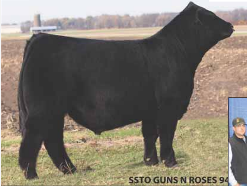
SSTS GUNS N ROSES 9408G