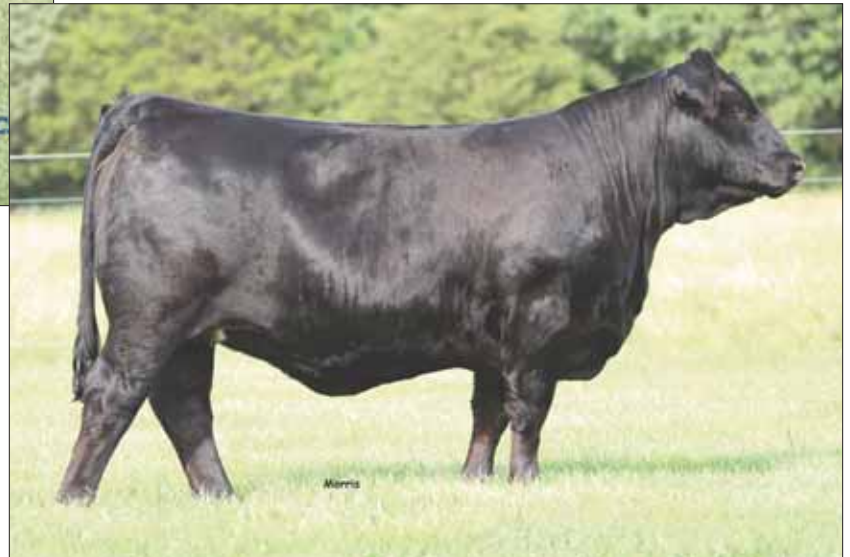
DAM: AUTO Fedora 222F