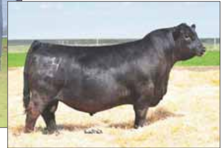
SIRE: HA Cowboy Up 5405