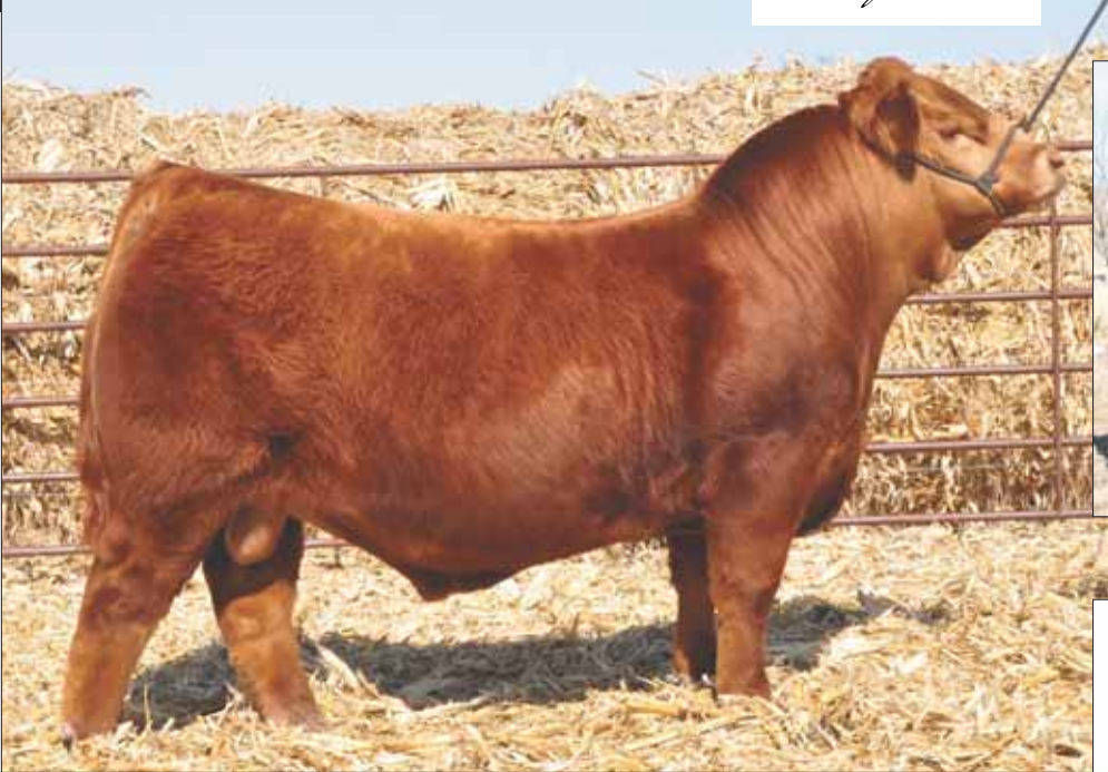
REFERENCE: L7 Huckleberry 0011H ET