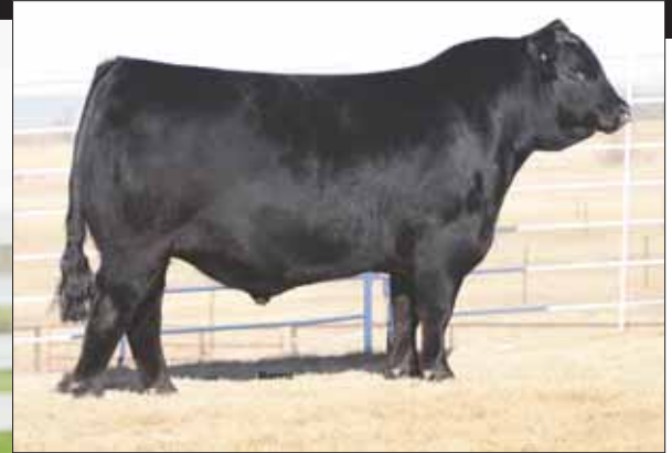
SIRE: MAGS Cable