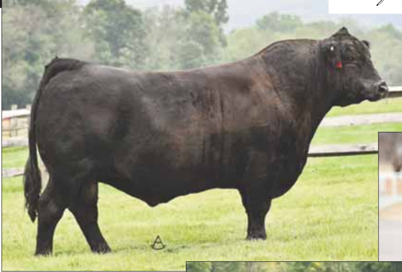
SIRE: CJSL Creed