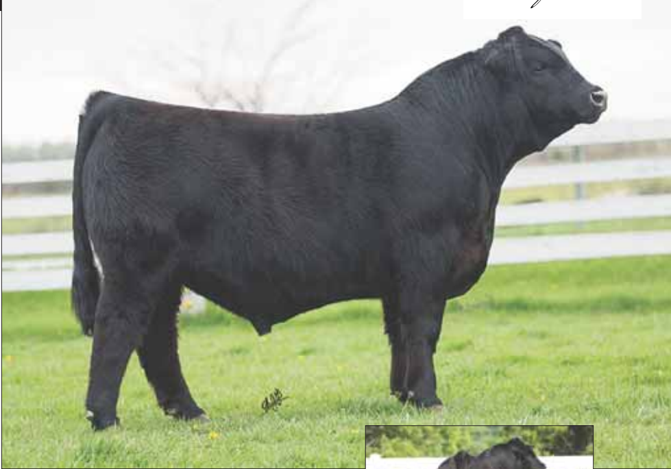
REFERENCE: FWLY LHC Capital ET