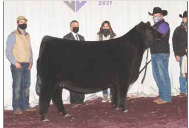
DAM: Ratliff Google 911G ET

Consigned by Magness Land & Cattle, Platteville, CO