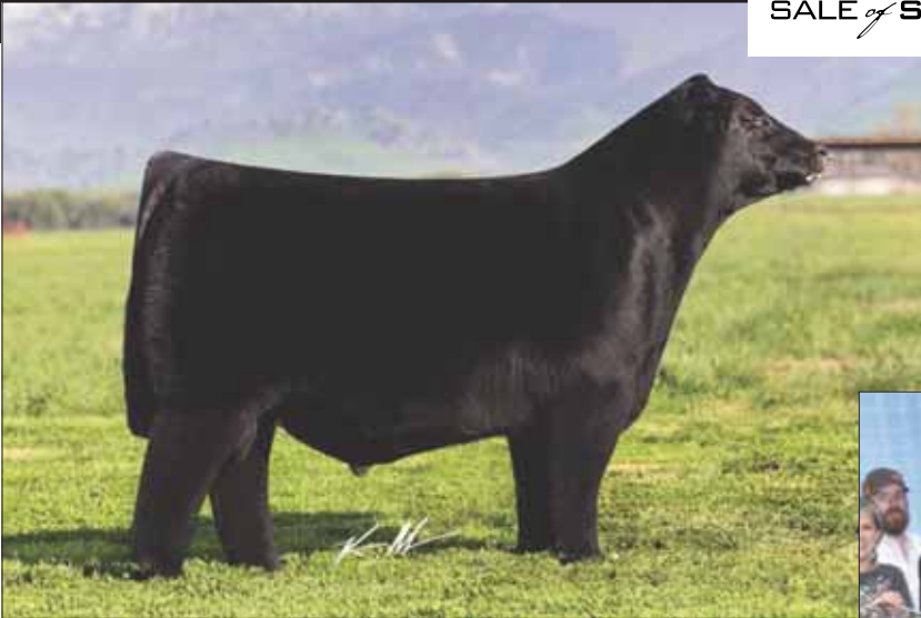
SIRE: Colburn Primo 5153