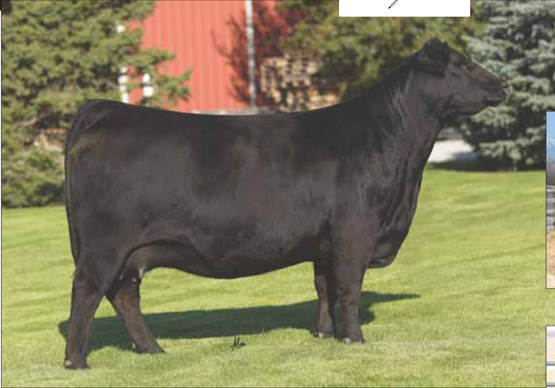
MATERNAL SISTER: AUTO 265D