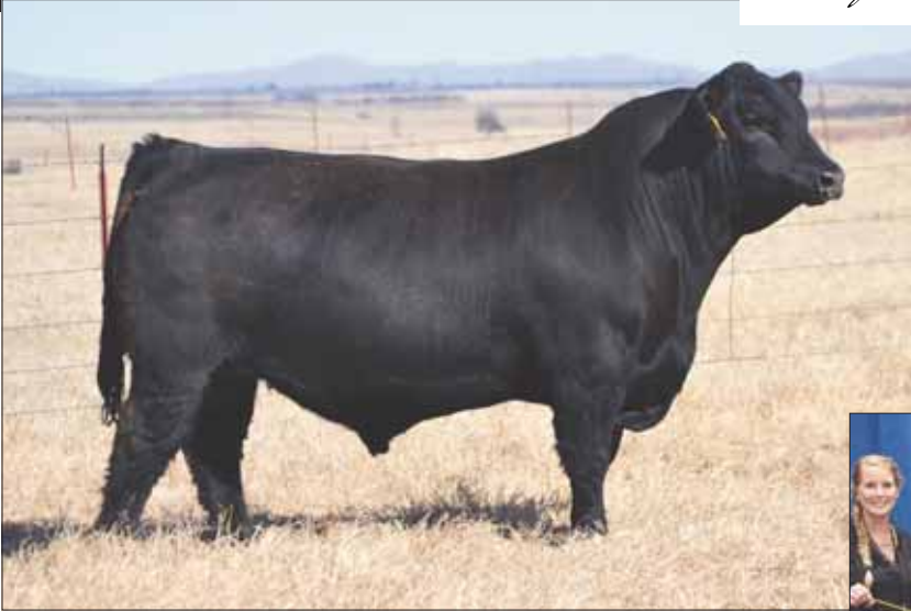
SIRE: LFL Gamer 9116G ET