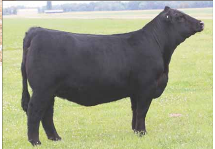
DAM: SSTO 9845G