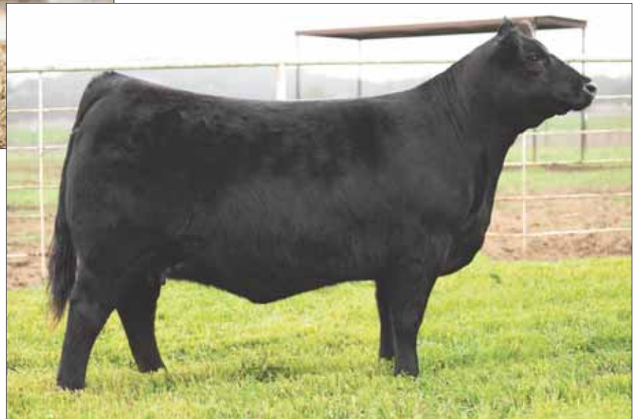
DAM: DL Faithfull 300F