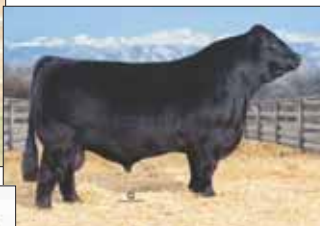
SIRE: ELCX Kings Landing 599D