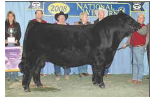
SIRE: DHVO Deuce 132R