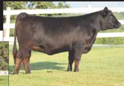
DAM: PBRs Diva Note 6298D ET