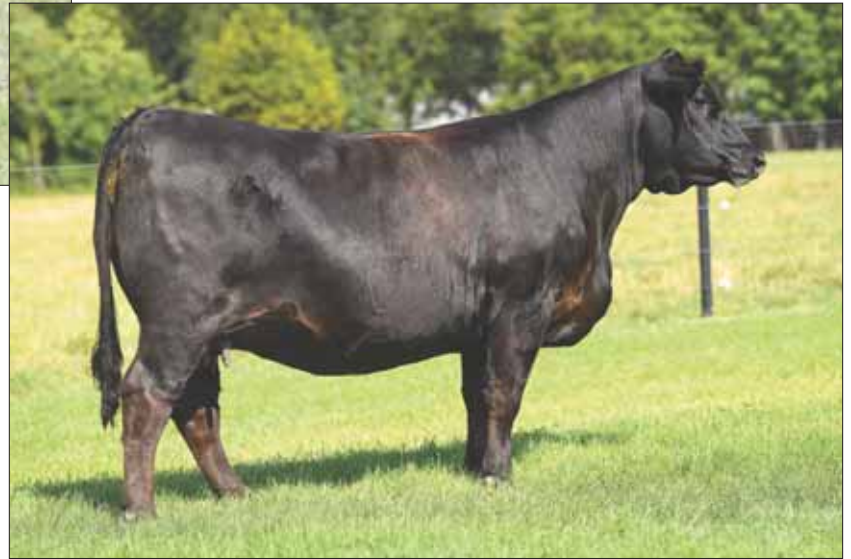
DAM: AUTO Folly 284F