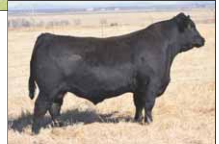
DAM: AUTO Bliss 265Y