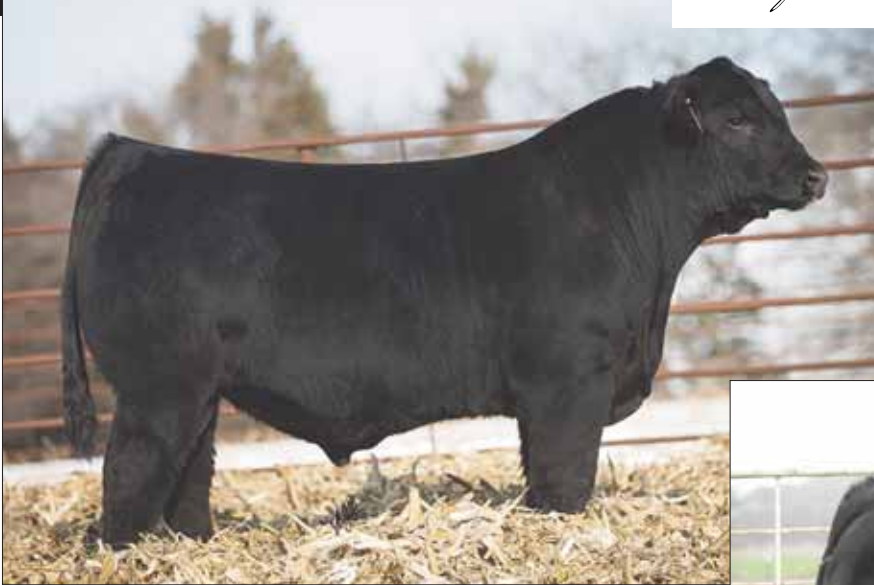
SIRE: CELL History Maker 0256H ET