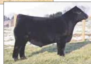
SIRE: TASF Heineken 405H