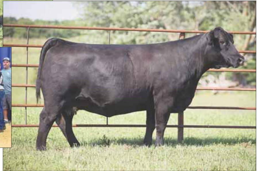
DAM: MAGS With Class