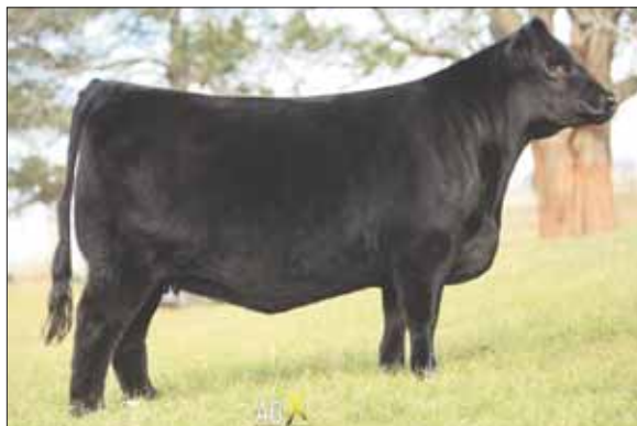
DAM: ELCX Elevate 684E ET