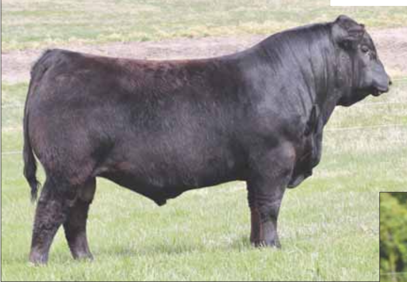
SIRE: L7 Bar Humdinger 0035H