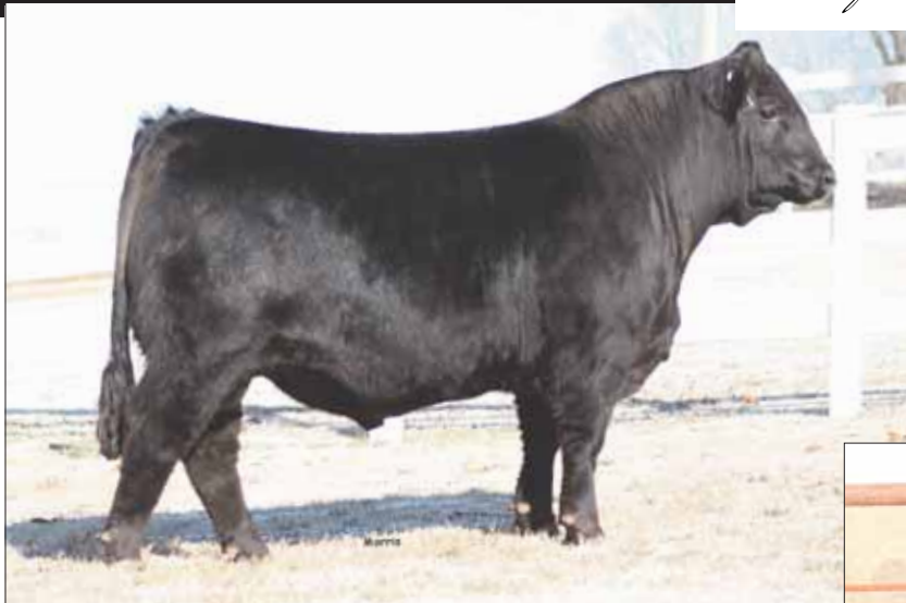
SIRE: TNGC Empire 736E