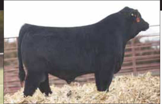
SON: CELL History Buff 0245H

Get your bids in fast on this proven purebred Limousin donor pair! CELL Miss Responder 6078D is a proven producer of high quality AI sires and it doesn't just stop there. This daughter of COLE Absolute 05A is as powerful as any purebred female in the marketplace today. Her dam is from the DHVO Deuce 132R and MAGS Ramada mating. CELL Miss Responder 6078D sure does do the job effortlessly. She is the dam of CELL History Buff 0245H, AUTO Blaque Blazer 100F and CELL History Maker 0256H.