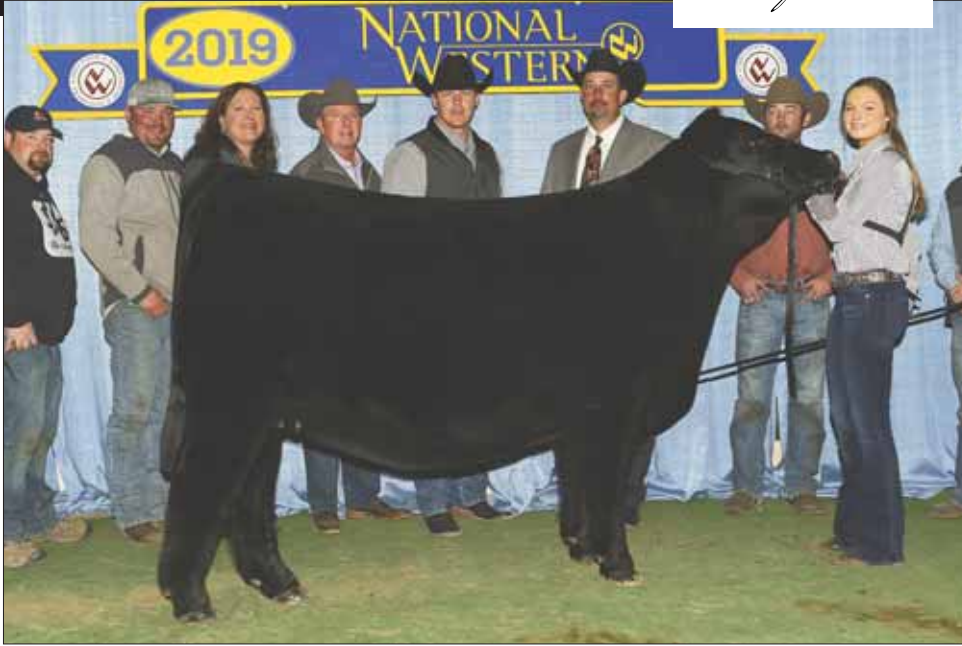
DAM: WLR Eden ET