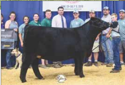
FULL SIBLING: TASF Forever Classy 216F