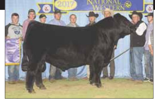
SIRE: TASF Crown Royal 960C ET