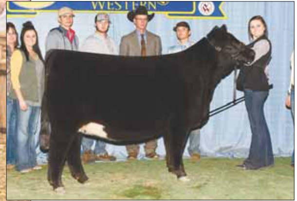
DAM: FWLY Purple Ribbon