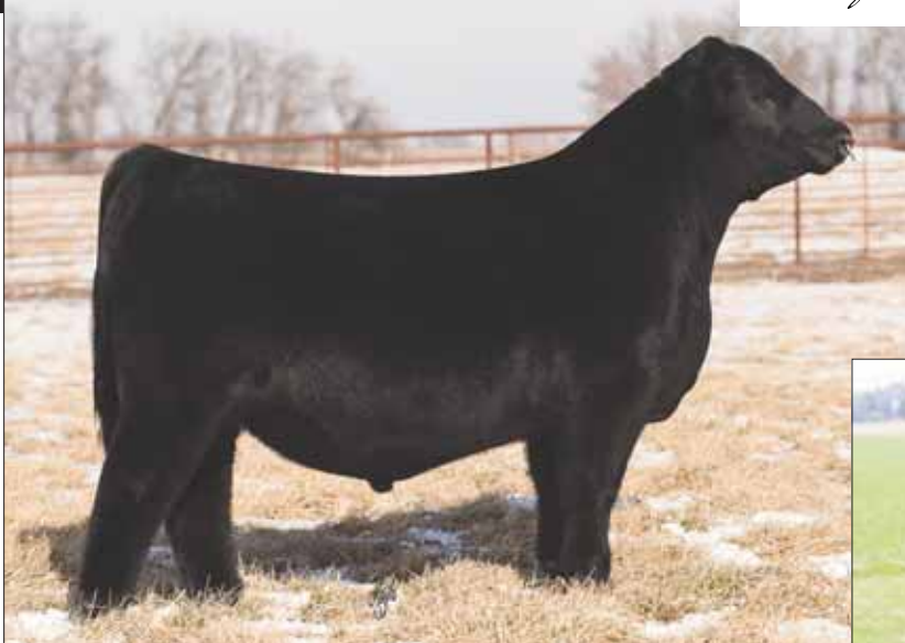
SIRE: PVF Blacklist 7077