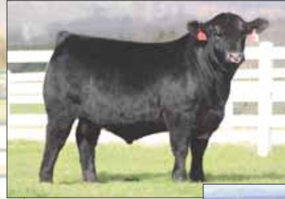
SIRE OF LOT 32A: AHCC Hemi 0901E