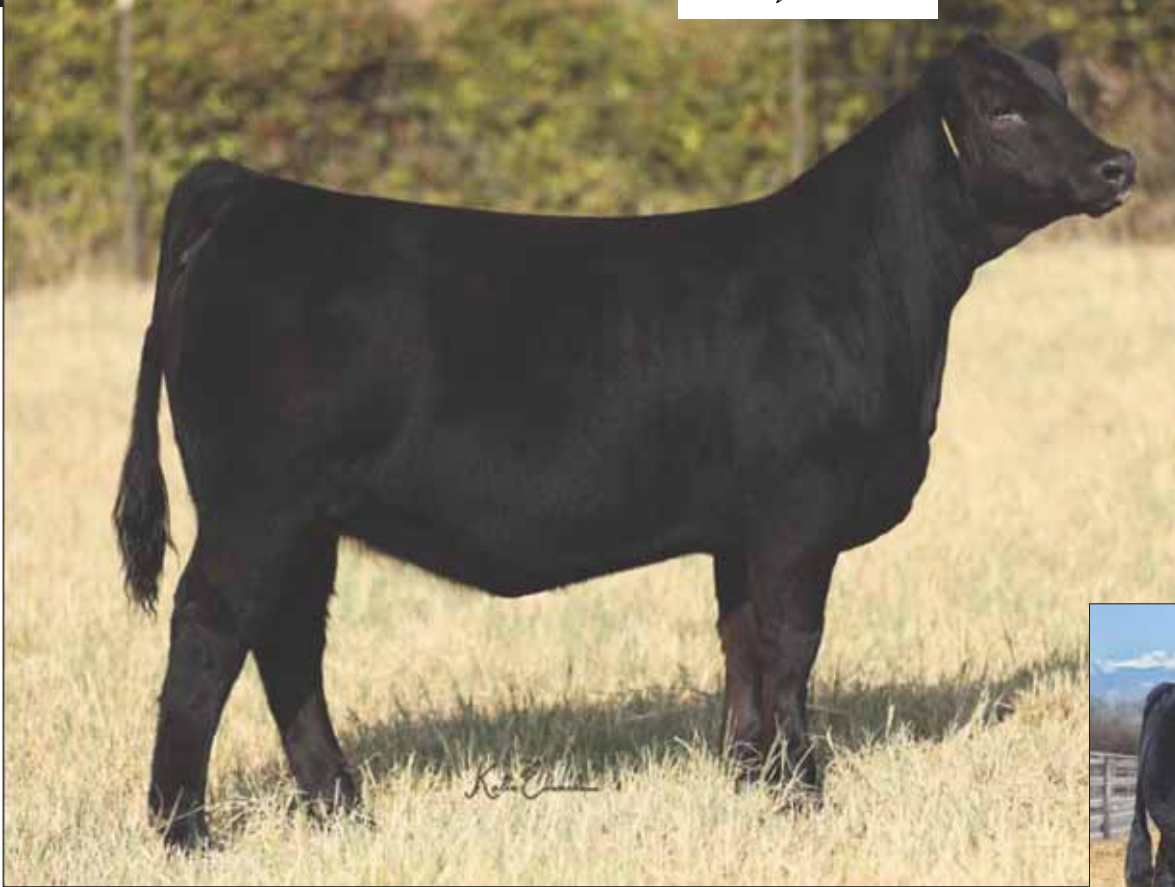
MATERNAL SISTER: DL Hush Money 502H