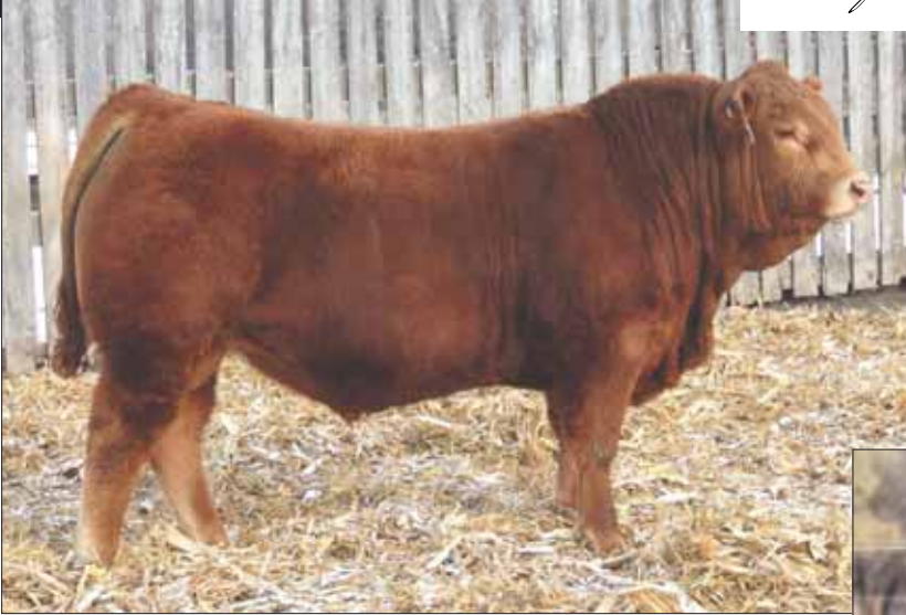
SIRE: TREF Hardcore 204H