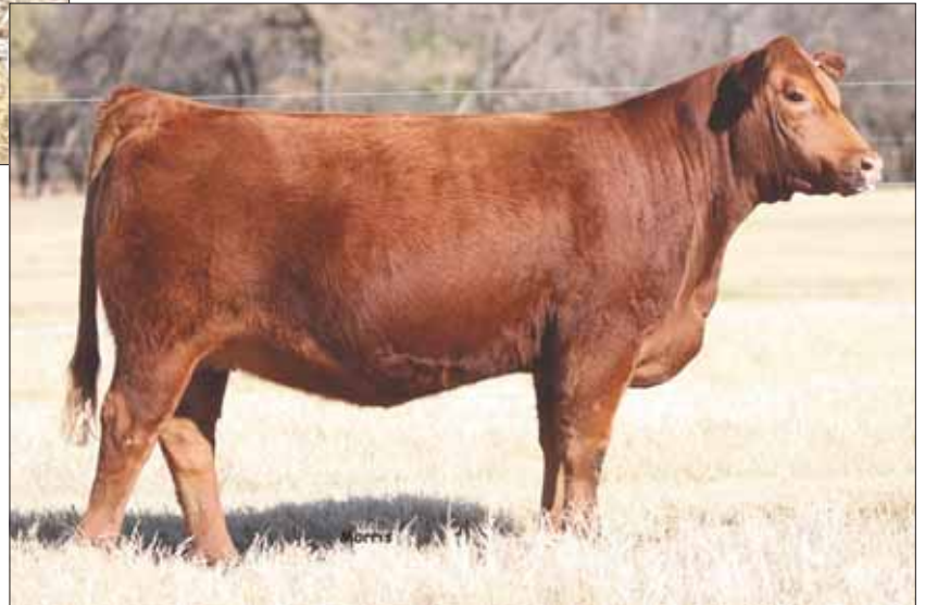
DAM: SSTO Darla 603D ET