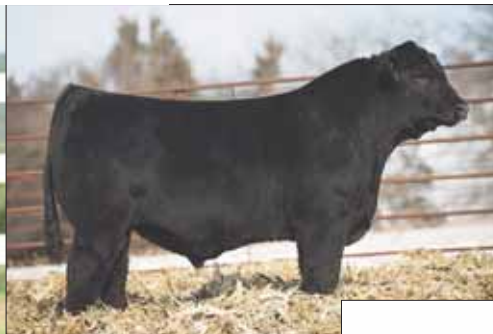
SIRE: CELL History Maker 0256H ET