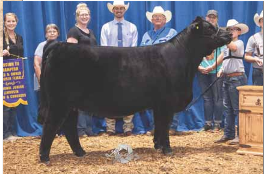
DAM: LFL Fiesta 8126F