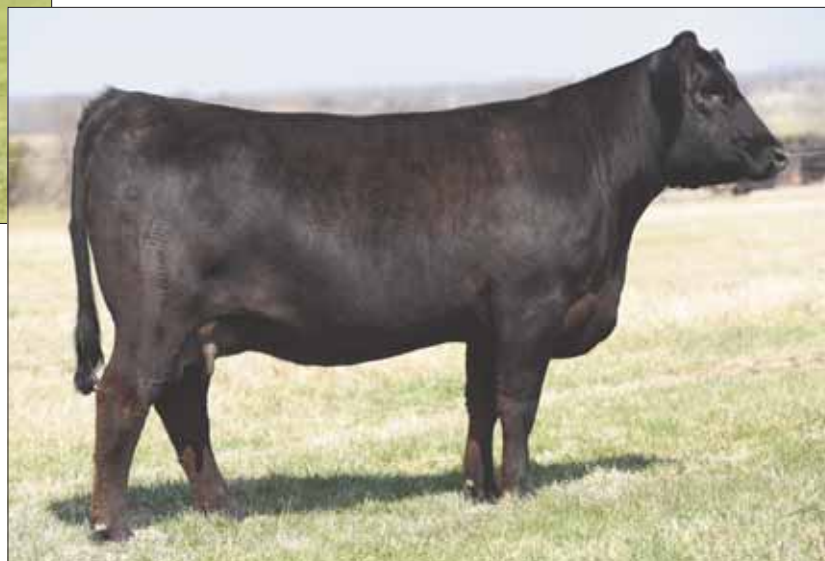
DAM: AUTO Darian 226D ET