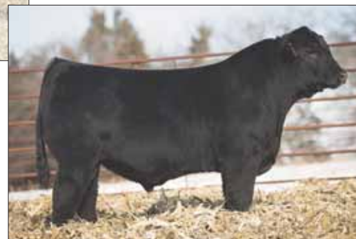
SON: CELL History Maker 0256H ET