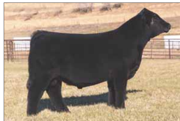
SIRE: KLS SULL Charmer

DHVO DEUCE 132R TASF WHISKEY LULLABY 357W TMCK DURHAM WHEAT 6030X HSF YOUR FANTASY AHCC XPENSIE ACCOUNT X516 COLE MISS TRAVELER 029X DHVO DEUCE 132R MAGS RAMADA