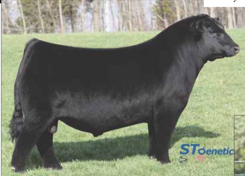
SIRE: Conley Dieckmann Prowess