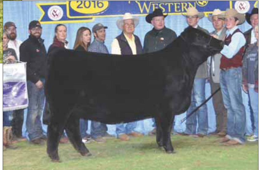
FLUSHMATE SISTER TO DONOR DAM: LH Belle 016B