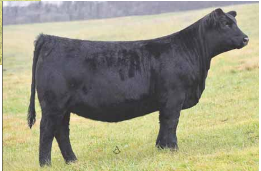
DAM: TMCK Foxtrot 569F ET