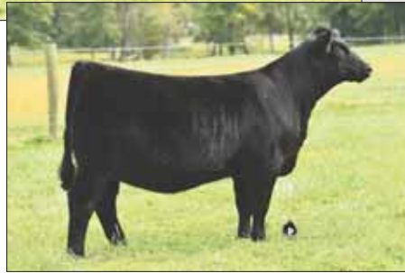
FULL SIBLING: TMCK Hint 782H