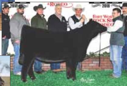
LOT 22B: SSto Epic 7854E