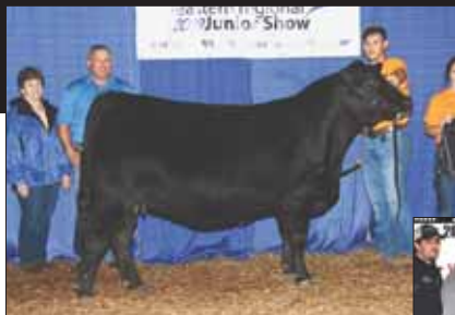
LOT 22A: CELL Empress 7343E