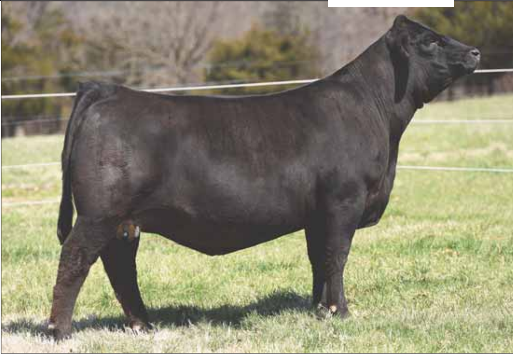
LOT 2: CELL Miss Responder 6078D

Selling 50% embryo interest in donor and her heifer calf at side