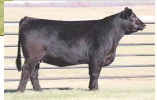
DAM: AUTO Ajay 206A