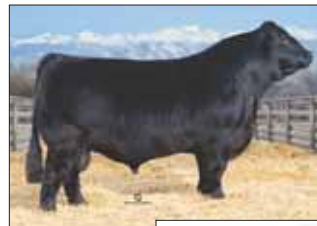
SIRE: ELCX Kings Landing 599D