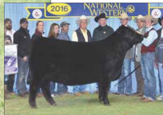
DONOR DAM: LH Belle Star 016B