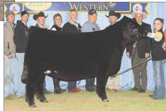
DAM: Riverstone Charmed