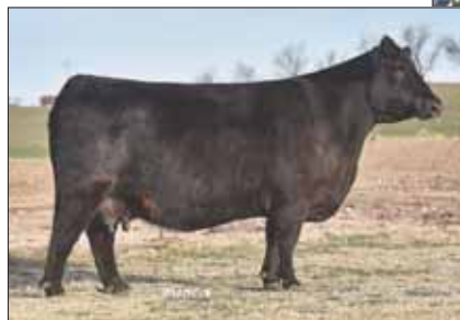
LOT 22C: MAGS Candrea