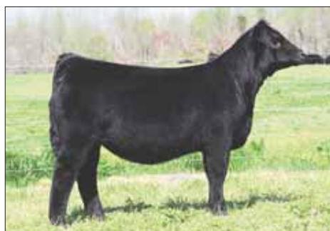
FULL SIB: ELCX Highness 056H

Sold for $20,000 to Linhart Limousin, Leon, IA, Davis Ranches, Brownwood, TX; Route 66, Marshfield, MO and Anderson Cattle, Hays, KS