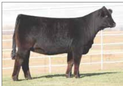
DAM: MAGS Evey

Consigned by KOLT Cattle Co., Seward, NE