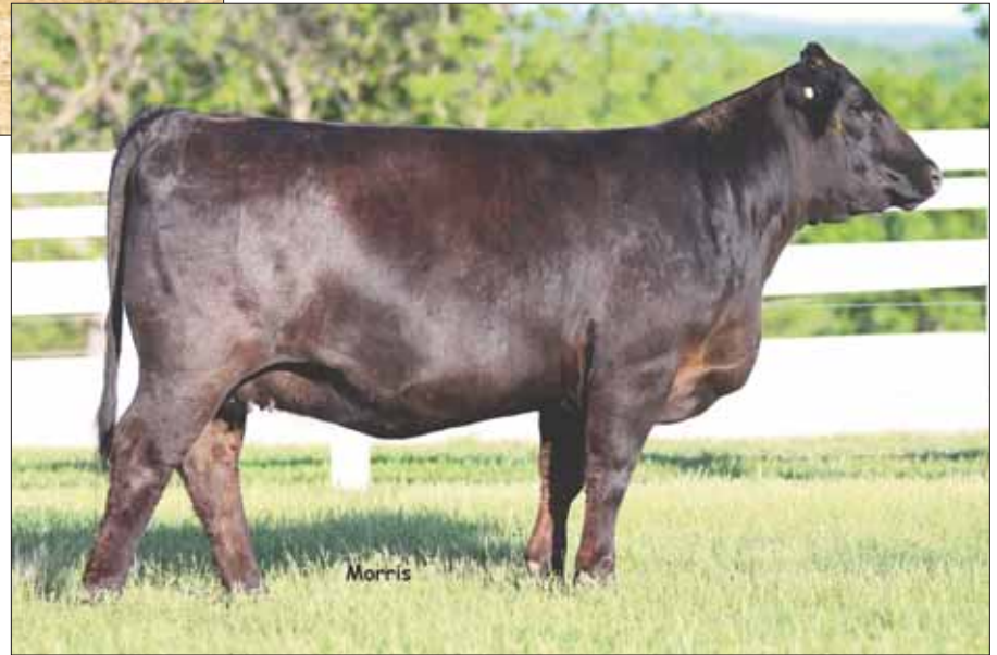
DAM: MAGS Blind Date ET