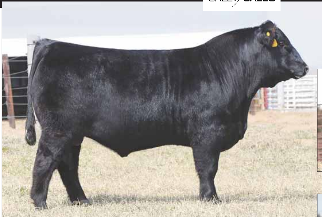
SON: CELL Envision 7023E