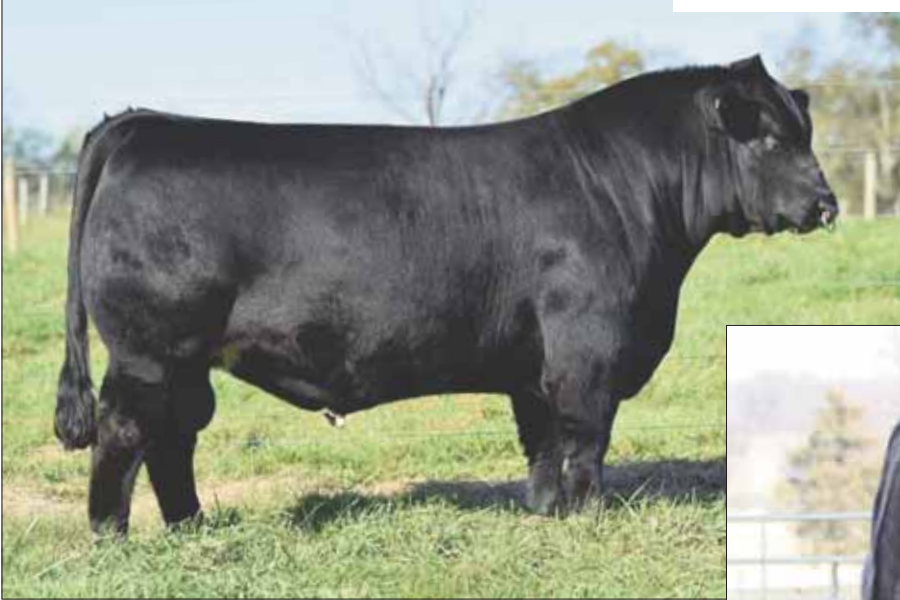
SIRE: CJS� Dauntless 6257D ET