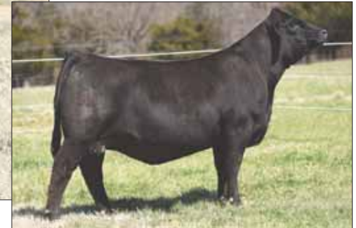
DAM: CELL Miss Responder 0678D