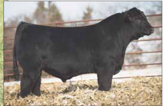
SON: CELL History Maker 0256H

These three AI sires are continuing to make a gigantic splash throughout the Limousin breed and far beyond. CELL Miss Responder 6078D sells with AUTO Helen 698H, her double homozygous purebred daughter sired by Riverstone Crown Royal. What a potent offering, folks! Selling 50% embryos interest in CELL Miss Responder 6078D and her heifer calf at side, AUTO Helen 698H. This could be the offering of the century, so dial your sights in on this fantastic pair!