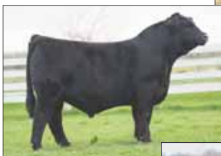
SIRE: FWLY LHC Capital ET