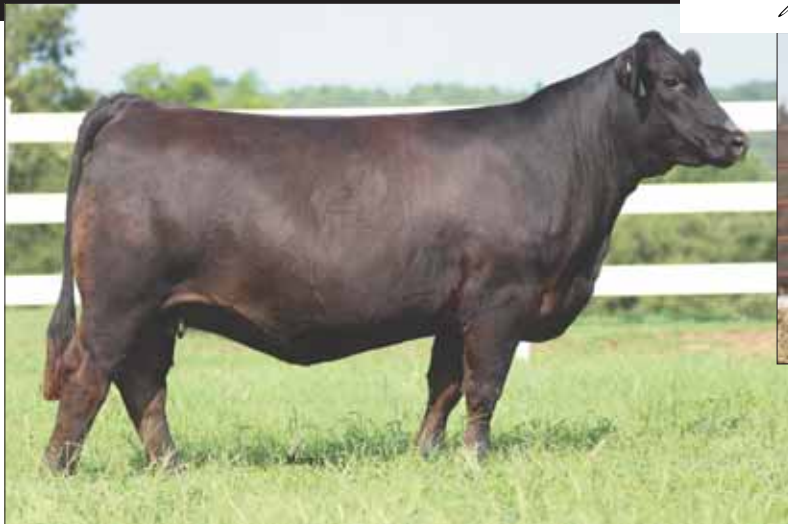
DAM: Dark Sunshine ET