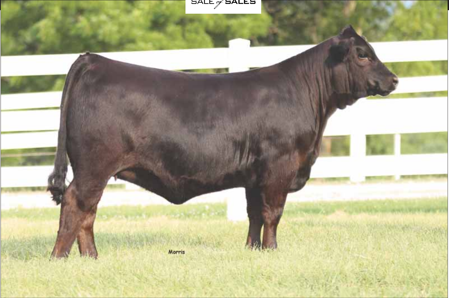
LOT 14: DLCN Halo 918H