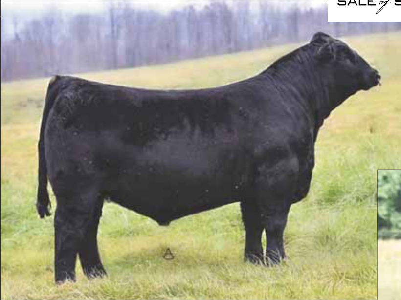
SIRE: TMCK Flashback