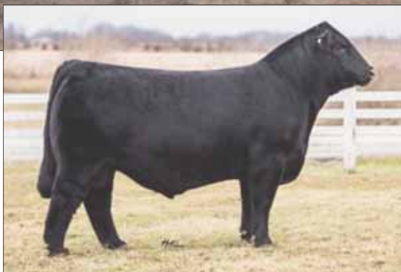
SIRE: FWLY Can Do