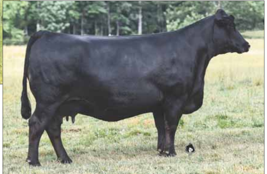
DAM: MAGS Bethany