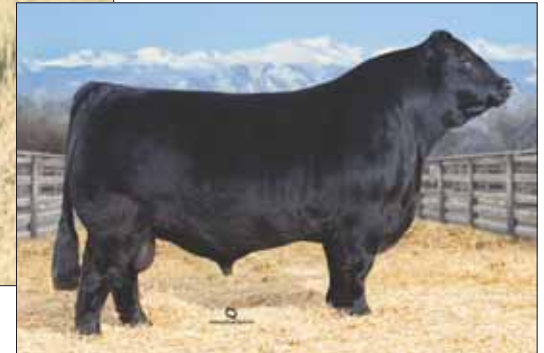
SIRE: ELCX Kings Landing 599D