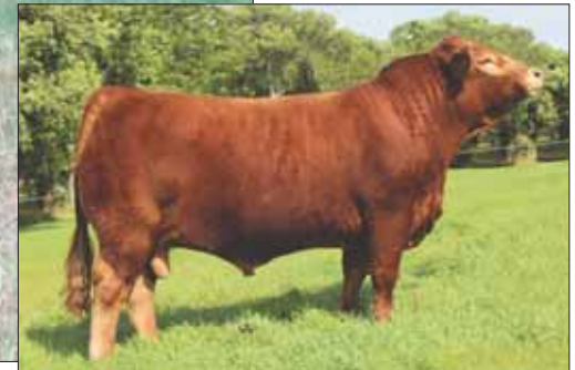
LOT 12: Wulfs Hadith 0017H