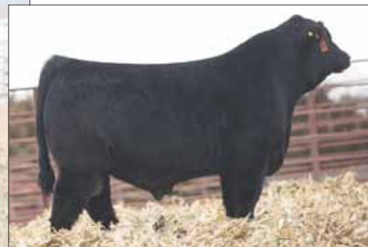
SON: CELL History Buff 0245H