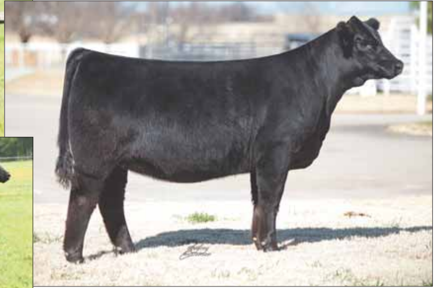
MATERNAL GRANDAM: DHIL Touch Me Gently 5798C