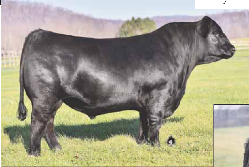
SIRE: COLE Genesis 86G