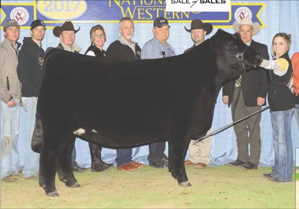
DAM: Riverstone Charmed