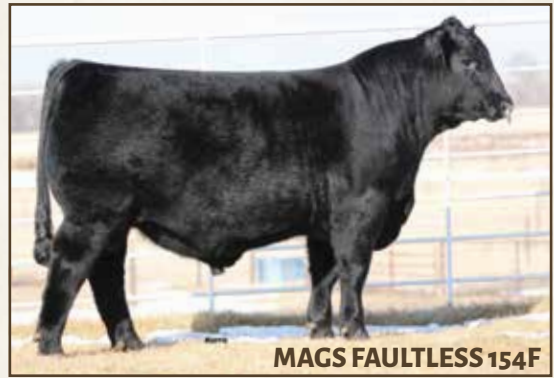
MAGS FAULTLESS 154F