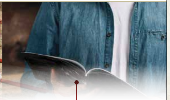
OFFICIAL BREED PUBLICATION