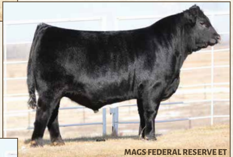
MAGS FEDERAL RESERVE ET