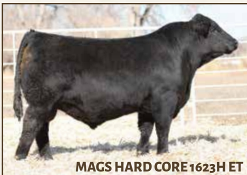
MAGS HARD CORE 1623H ET