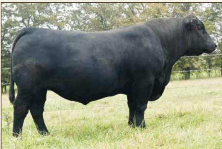
AHCC EASY RIDER 5594E