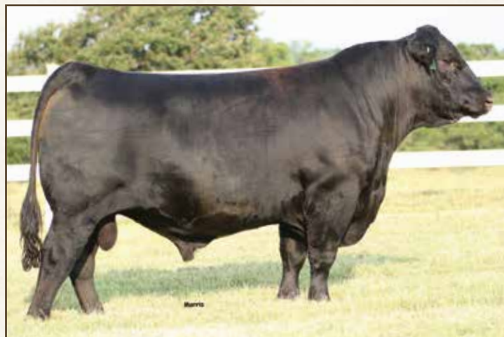
MAGS GOOD WILL 130G Sire of Lot 2

This herd sire prospect brings the pounds and performance. Here is a big, stout, wide-made, ruggedly designed Lim-Flex that comes to us in a heavyweight, homozygous polled, homozygous black package. He is sired by MAGS Good Will 130G, the young, AHCC Dakota Thunder 363D son that sires fast growing, high performing progeny. His dam is a beautifully made PBRS Bunk House 48B daughter. On paper, MAGS Kentucky Bourbon ranks in the top 50% for weaning weight and yearling weight. He recorded a 723 lb. 205-day-weight. He has the data and pedigree to do big things for your operation.