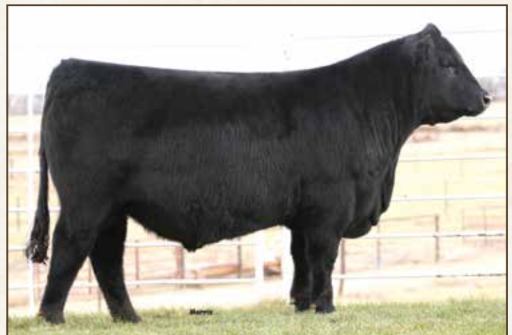
PBRS ENCORE 7195E ET

This powerfully built, red herd sire prospect has an alluring phenotype. He is stout featured, wide based and brings added growth, muscle expression and performance. His sire is the popular PBRS Encore 7195E ET, proven to sire heavily muscled, sound, high performing progeny everywhere he has been used. His dam is a highly productive MAGS Yip daughter. This fresh pedigreed individual will be a great addition to your herd bull pen.