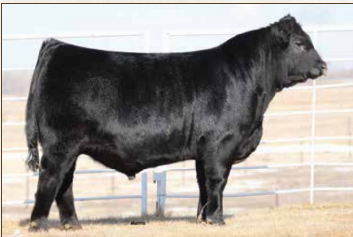
MAGS FEDERAL RESERVE ET

Here is an impressive MAGS Federal Reserve son that checks all the boxes. Heavily muscled, rugged, big bodied and sound on the move. His dam is a highly productive MAGS Winston daughter. Numerically, he has a well-balanced EPD profile, he ranks in the top 20% for both weaning and yearling weight, top 3% for marbling and top 2% mainstream terminal index. What's more, he is homozygous polled. Bid with confidence, this herd sire prospect will have a tremendous impact on your cow herd.