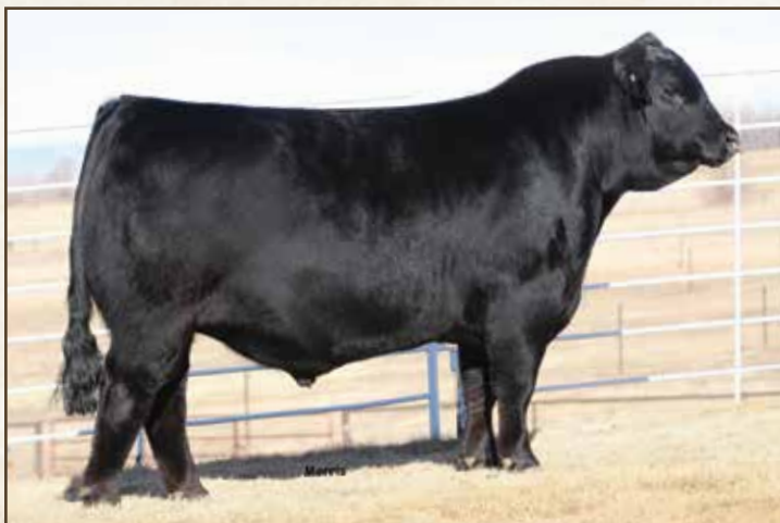
MAGS CABLE Sire of Lot 5

Study this attractively made, homozygous polled, homozygous black herd sire prospect that combines softness, athleticism and muscle expression. He is a son of popular MAGS Cable who has produced numerous great ones. His dam is a tremendous MAGS Zodiac daughter that is beautifully designed and functionally correct. Numerically, MAGS Knocked Out 2608K ranks in the top 20% for weaning weight, top 20% for yearling weight, top 3% for docility and top 25% for marbling. His calves will be a hot commodity.