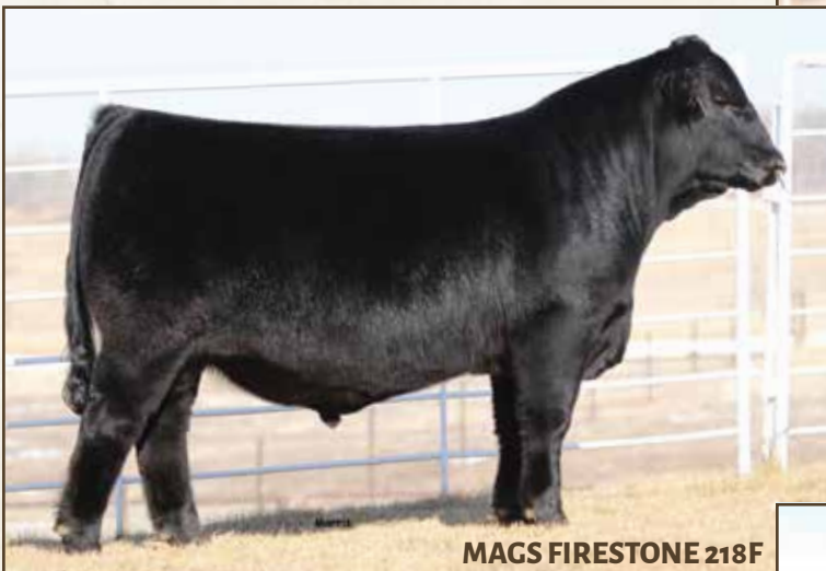
MAGS FIRESTONE 218F