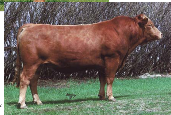
Sire, WSI Umemaru