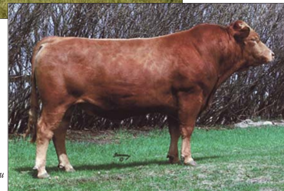
Sire, WSI Umemaru