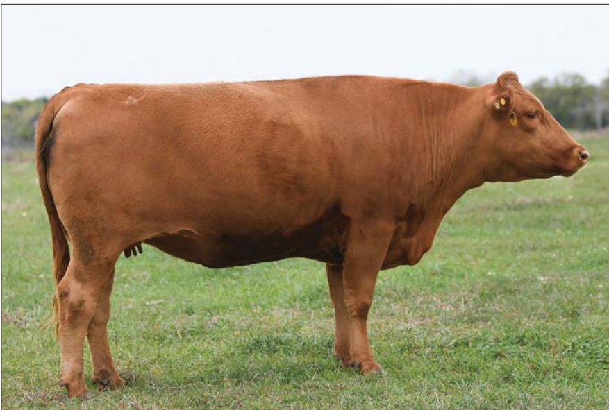
Donor Dam, LAG 2158F