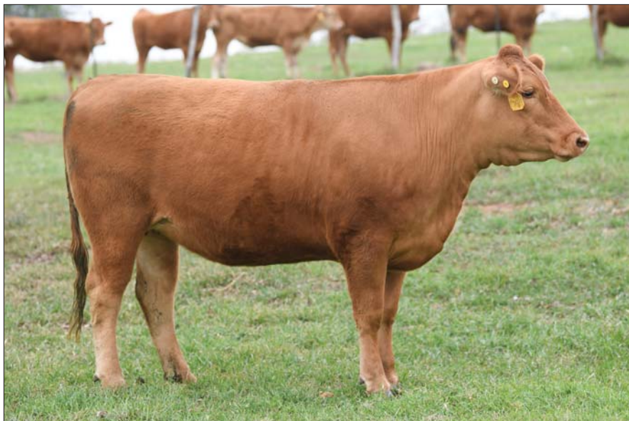
Donor Dam, LAG 2344H