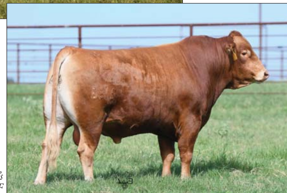
Sire, LAG Rueshaw's XXX 2133F