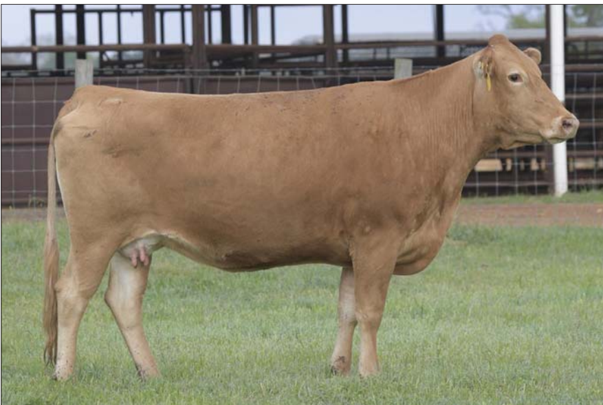
Donor Dam, HeartBrand 2077A