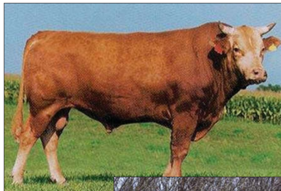
Sire, Hikari 830