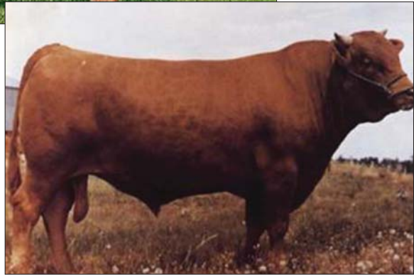
Sire, Rueshaw 430