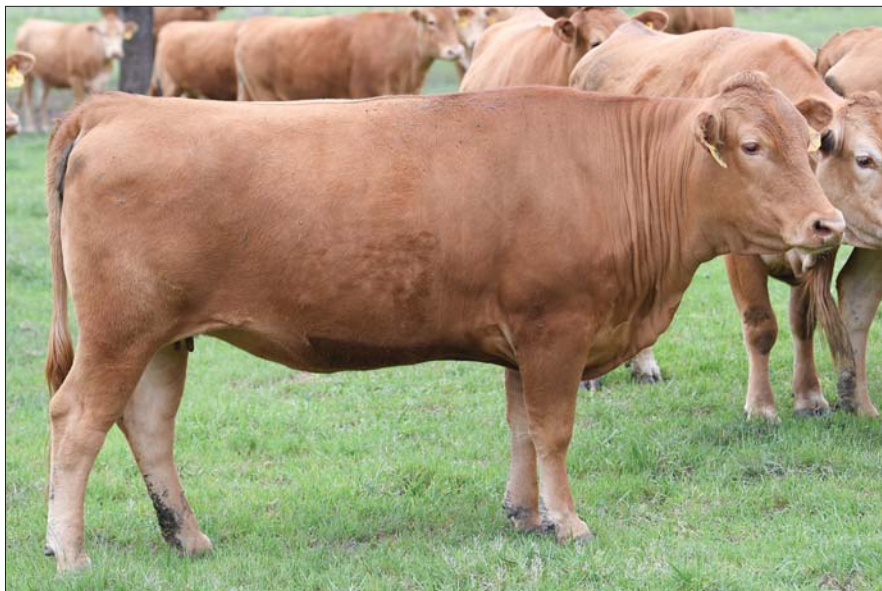
Donor Dam, LAG 2148F