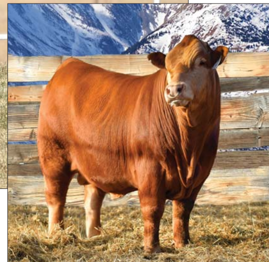
Heartbrand King David, son of Nickeson 309A