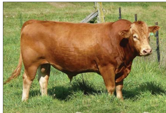
Sire, The Wright Wagyu Master Chef E146