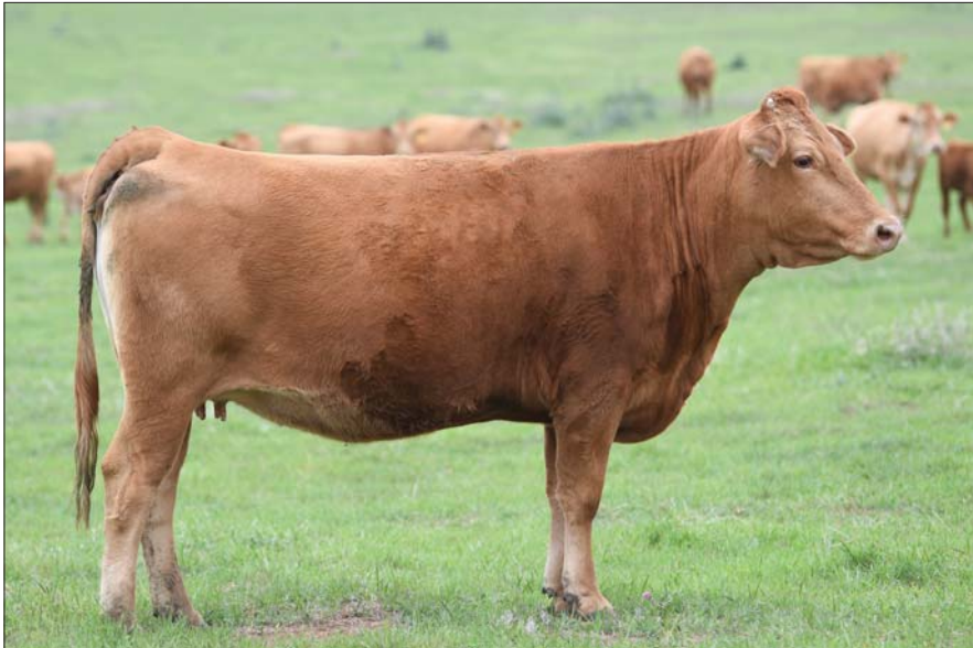
Donor Dam, HeartBrand 1400F ET