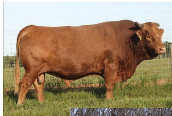
Sire, Big Al