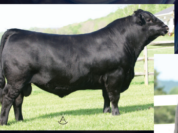
TMCK Cash Flow Sire of Flush